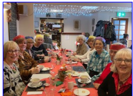
Members of the Tap Dancing group enjoying their Christmas Lunch at Stourbridge Institute.