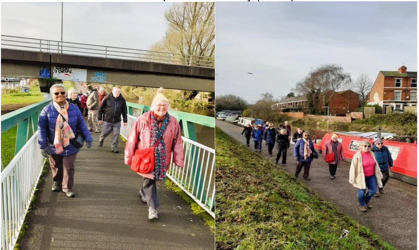
Out and about the Walking Group.