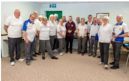
U3A Indoor Bowls Members