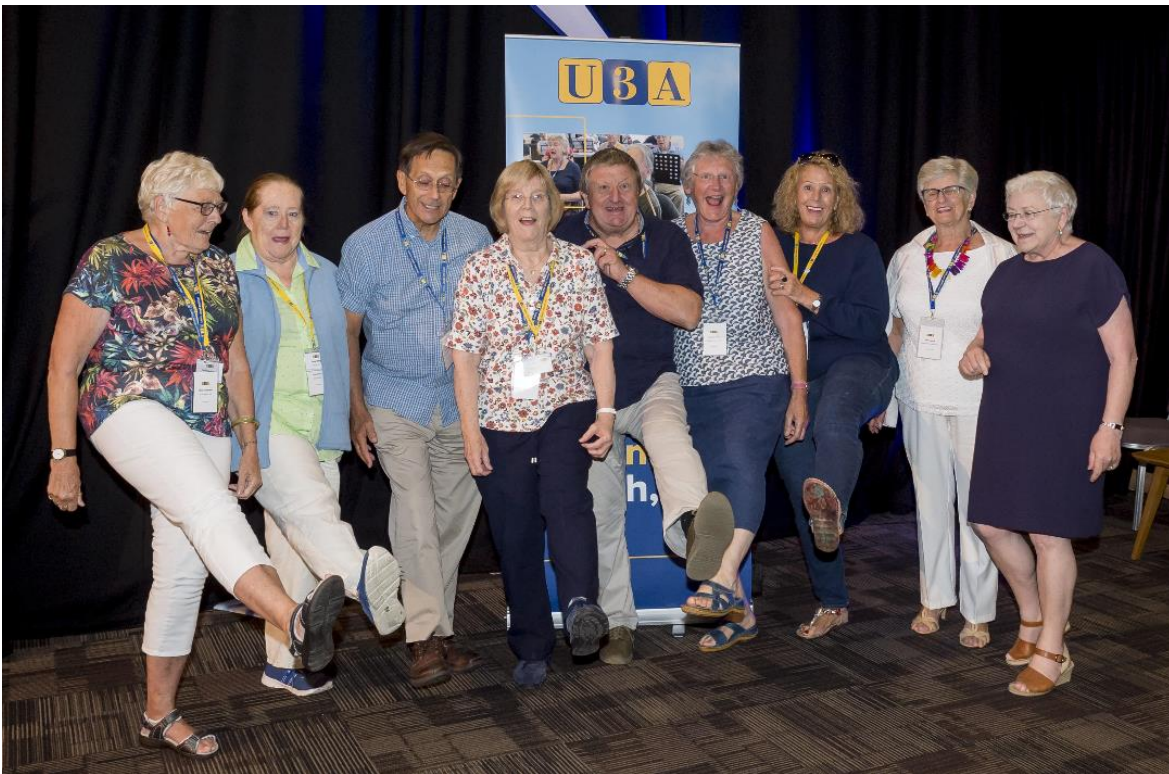
Some of the South East Region Support Team at last year's National Conference