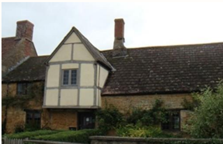
Exterior of The Old House showing the extension above the front door which contains the painted room

Another popular visit in October was when the group visited 2 very different buildings in Castle Cary. The first, The Old House at Cockhill, is a rare survivor of a medieval farmhouse with unique wall paintings.