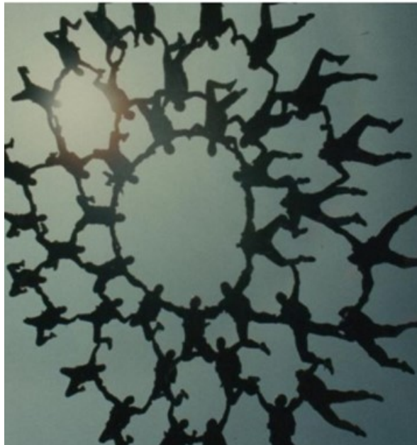
Lottie free falling with 39 other team members