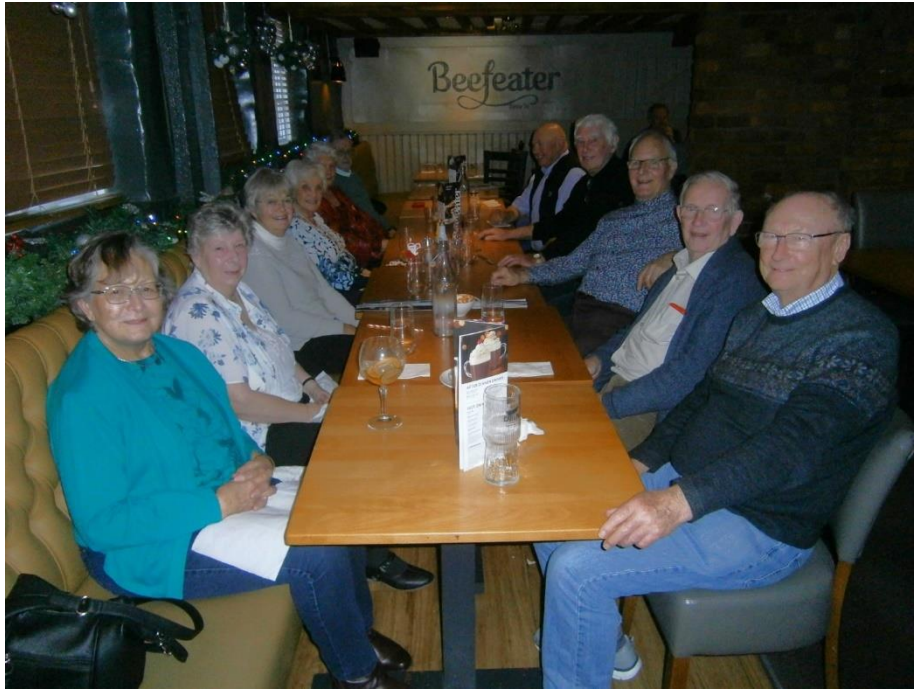
We meet on the last Thursday of each month and we had to “book early for Christmas” returning to an old favourite and booking in early October, as Members wanted a Christmas Couples Lunch again this year. As Members know we don’t pre-advertise where we are going to eat to all Members just the