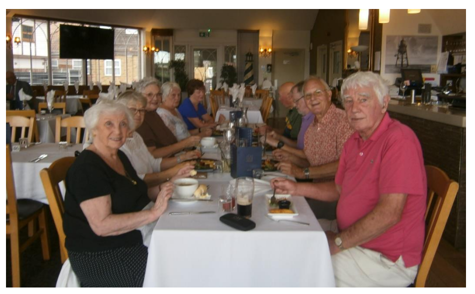
sign "Chef required" on the way in - but all was well!

'The Couple Lunchers' had such a nice meal at the Oyster Fleet on Canvey Island earlier in the year that we decided to revisit for our July meeting and a good time was had by all. The food was up to standard again and the service. Even though it was a bit disconcerting to see the