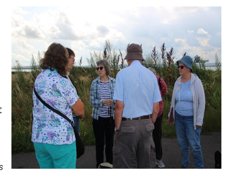
The organisers organising!