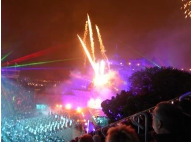
Photo Fireworks at the 2018 Edinburgh Tattoo

Welcome to this month's newsletter, hopefully everyone has recovered from the crashes, bangs and wallops of this year's bonfire celebrations.