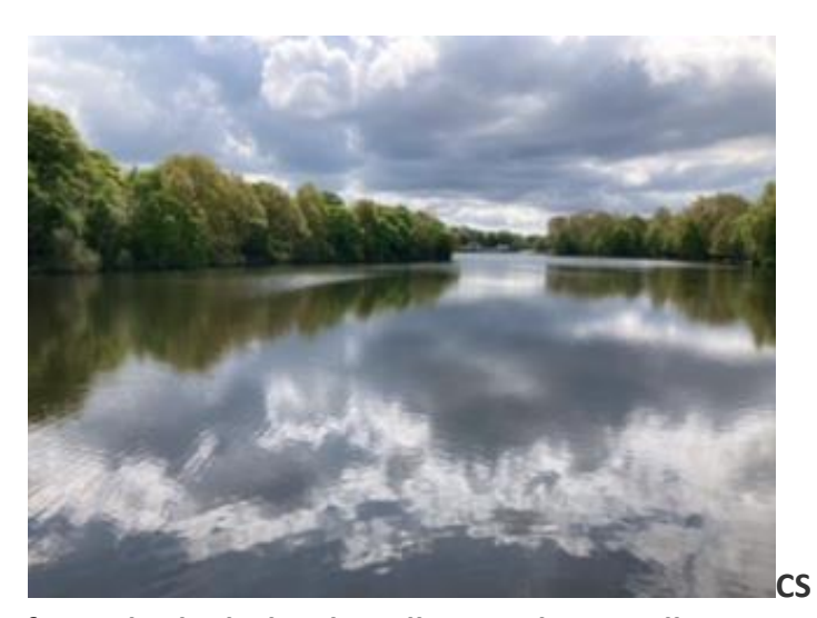
8 of us today had a lovely walk around Carr Mill Dam.

The weather was sunny and warm with lots of ducklings and wildlife to be seen. The bluebells were beautiful. Afterwards a most delicious lunch at the Toby Carvery was enjoyed by everyone.