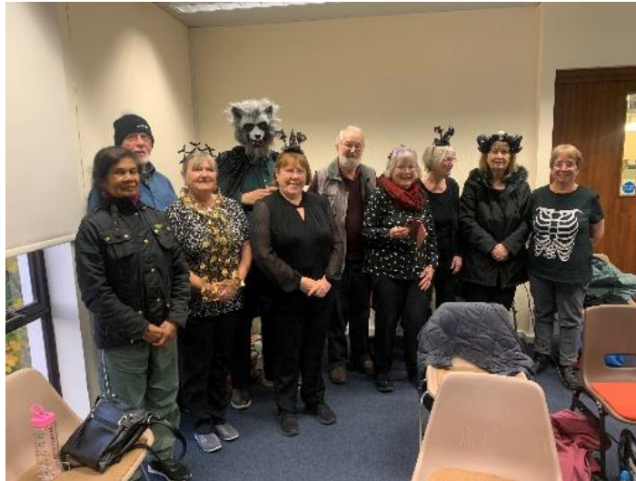
Halloween Singing for Fun

u3a is a UK wide, cooperative movement of people no longer in full time work who come together to continue their educational, social and creative interests. Our branch of the nationwide U3A is now in its twelfth successful year. If you are interested, you are most welcome to join us for a free taster visit to one of our activities . For further details please Telephone 01695 726660 or visit Skelmersdale u3a:Home . Joining us in Skelmersdale u3a is a great way to find and develop new interests and make great friends in a relaxed environment. Membership fee is only £12 a year.