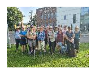
All images are from Summer School 2023