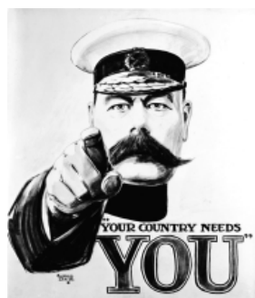
Drawing by Alfred Leete.