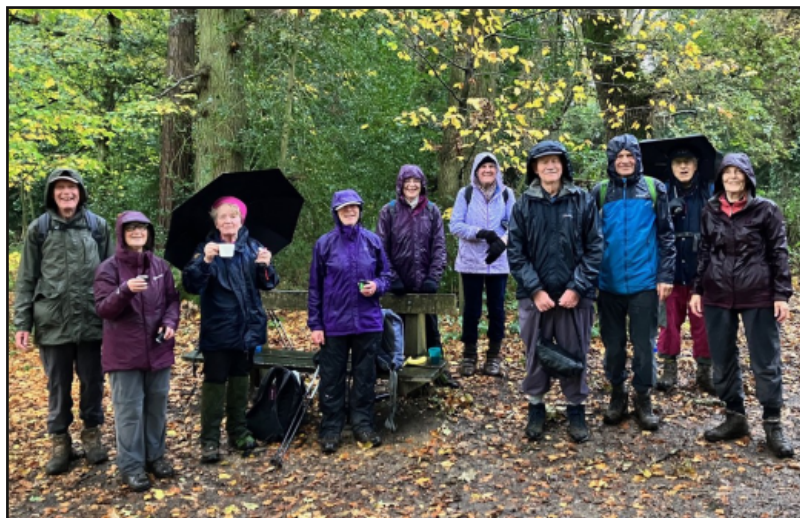
A very wet walking group in November!