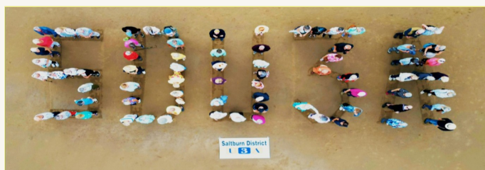
The finished 'product' – well done everyone!

It was a lot of fun and we hope you will agree, once you have watched the footage and seen some of the still pictures that were produced, that SDu3a will have some memorable images to use now and in the future.