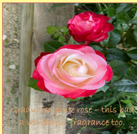
Graduated pink rose – this had a wonderful fragrance too.

By the end of the tour, each visitor was clutching a small bouquet of cuttings and blooms to take home. The photographs here show only a small variety of the beautiful plants that were on show at the end of June.