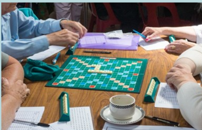
Saltburn & District u3a members playing Scrabble

Saltburn District u3a started out as part of Whitby Whalers but, with the help of a Lottery