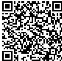
QR code for H&T survey

If you haven't done the survey, we would encourage you to do so - to help you access it, there's a QR code below that your smartphone or tablet can use to open the online survey. There is also a link to the survey on the website (see the Latest News page) and we have paper versions available if you would prefer one.