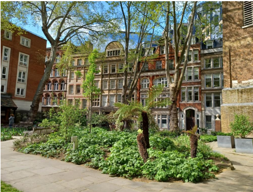
Postman's Park