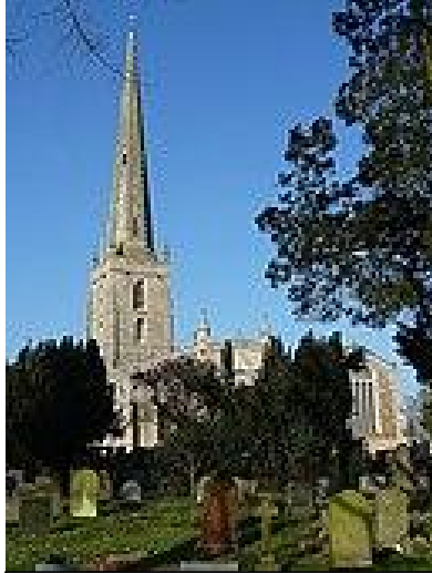
St Mary, Bottesford