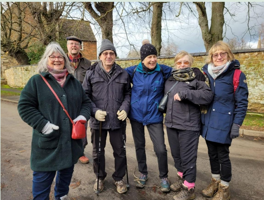
The walk, talk and snack group on a recent walk.

See our website: https://u3asites.org.uk/rutland/home if you would like to join us, or if you would like more information.