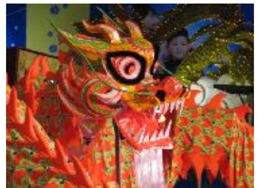
Vietnamese New Year - the year of the dragon