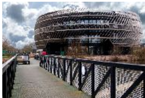
The Ingenuity Centre - Jubilee Campus ,Nottingham University

Last month's theme of modern architecture got members out and about in Nottingham. April's theme of "Decay and Dereliction" may be more challenging. In May, the topic is "Water" giving the opportunity for numerous interpretations, and there will be an outing to Newark on 17th May. All photographers, whatever your level are very welcome. Our aim is to share skills and develop new ones whilst having fun.