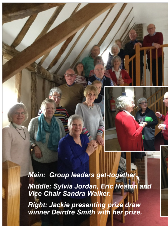
Main: Group leaders get-together.