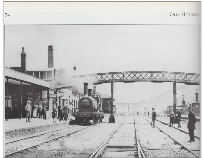
Hitchin station footbridge c1880

Nowadays it is difficult to realise how many different trains stopped or terminated at Hitchin - from London, Bedford, Leicester, Royston and Cambridge, to York, Newcastle and Leeds.