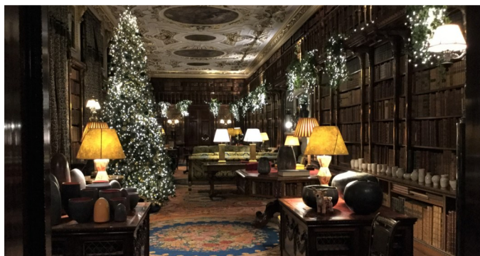
Christmas decorations in the Library