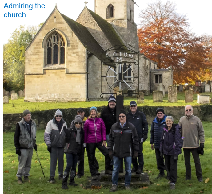
Admiring the church

'the route provided a number of opportunities to admire long views from high ground'