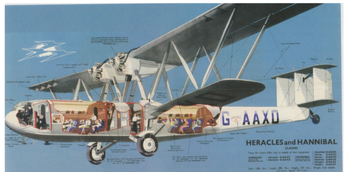
Top: Dining in style. Middle: Imperial Airways' silver deluxe passenger saloon. Above: The 1930s Heracles and Hannibal set new standards of safety and comfort.