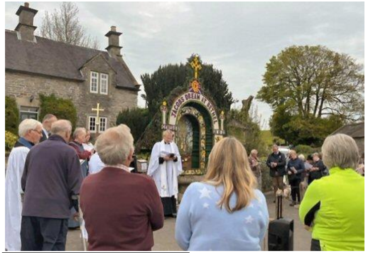
Blessing the wells