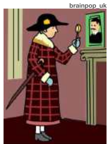
Agatha Christie is one of the OU modules on offer

Courses are available at beginner, intermediate and advanced levels. The number of study hours varies; 'Astronomy with an Online Telescope' has 24 hours of material, whilst 'Advanced French: At the Science Museum in Paris' has 15 hours. 'Agatha Christie and the Golden Age of Detective Fiction' requires eight hours of study, as does 'An Introduction to Music Theory'.