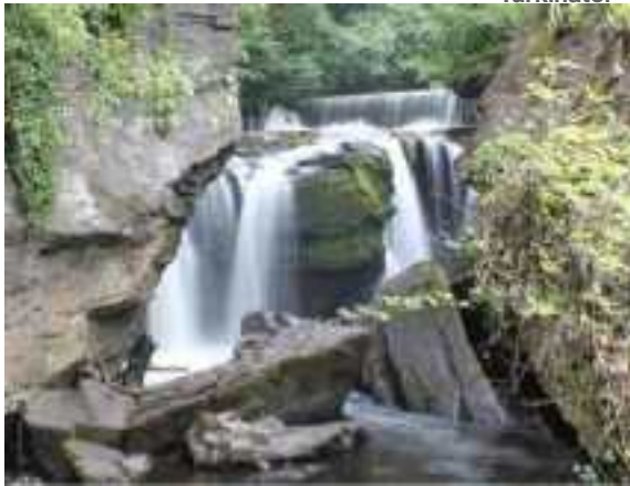
Aberdulais Falls in Wales