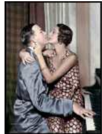
Noel Coward and Gertrude Lawrence, 1930