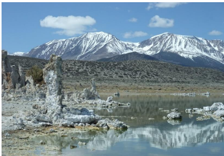
Lake Mono, California