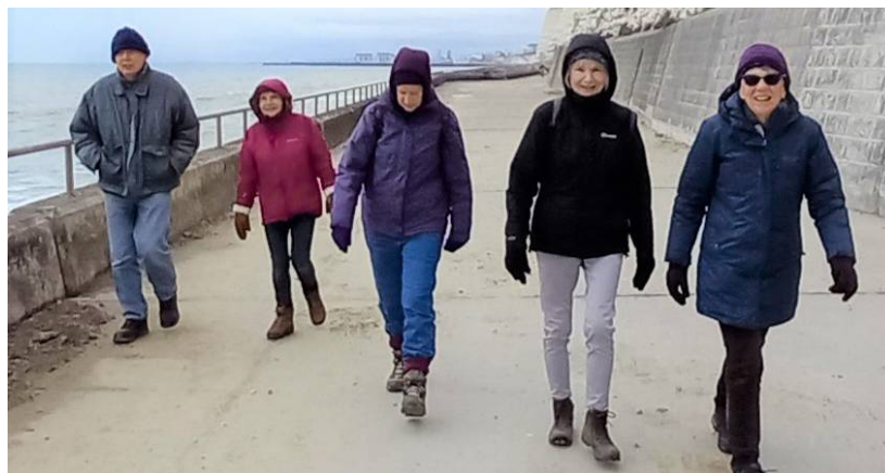
We braved the elements at Rottingdean along the undercliff.

I know that we have walked twice a month as a group but I can't always remember where! This makes a report hard to write. About five mile walks are usual with beautiful flowers in the spring on familiar and much loved walks along with some new routes.