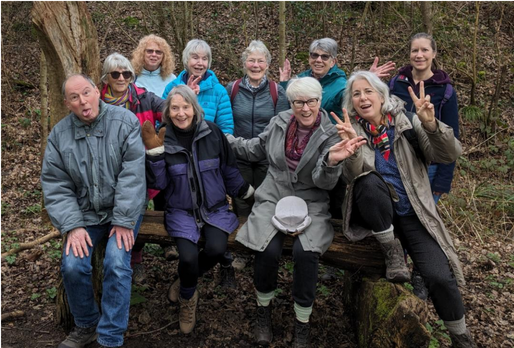
A happy (and mischievous ?) walk.

It was wonderful to see the spring flowers on the roadside verges on the recent circular road walk from Chidingly church and the start of the wood anemones between the trees. A dozen members turned out and the weather was kind.