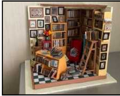
Far left: House, 30cm high, 25cm wide and 20cm deep.