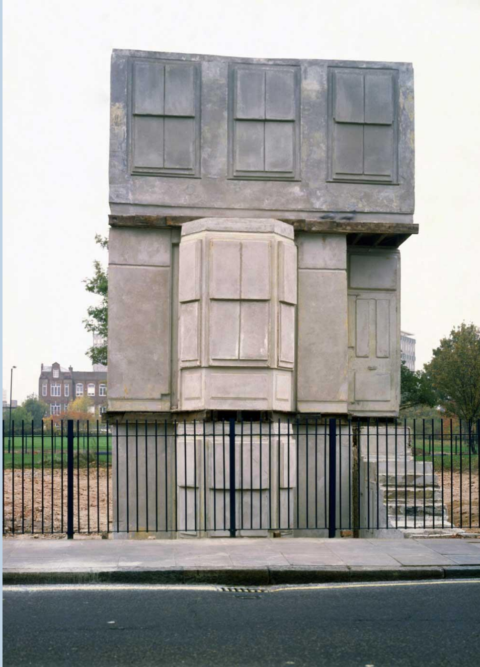
Rachel Whiteread 1963- House 25/10/93-11/01/94, Concrete & reinforcing Grove Road, Tower Hamlets, East London