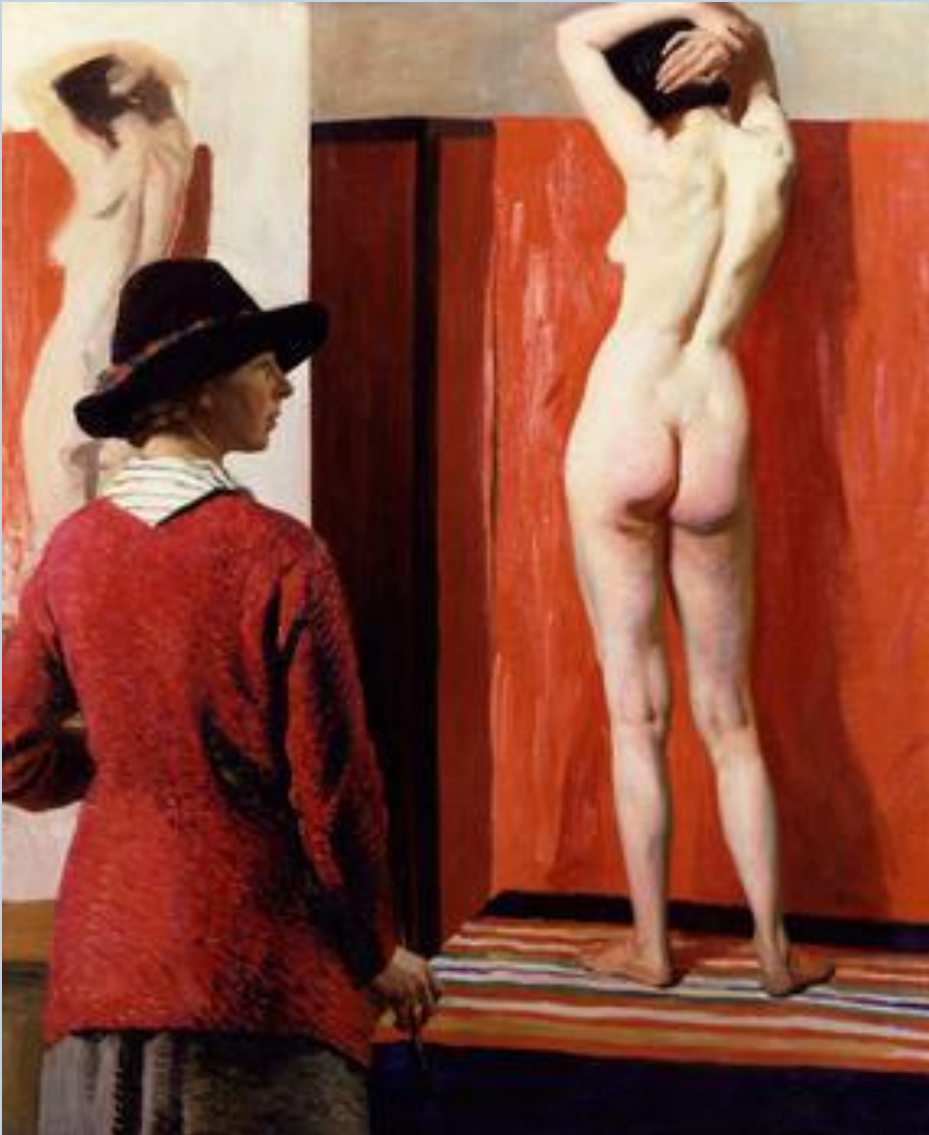
(Dame) Laura Knight 1877 - 1970 Self Portrait with nude (aka Self Portrait), 1913, National Portrait Gallery.