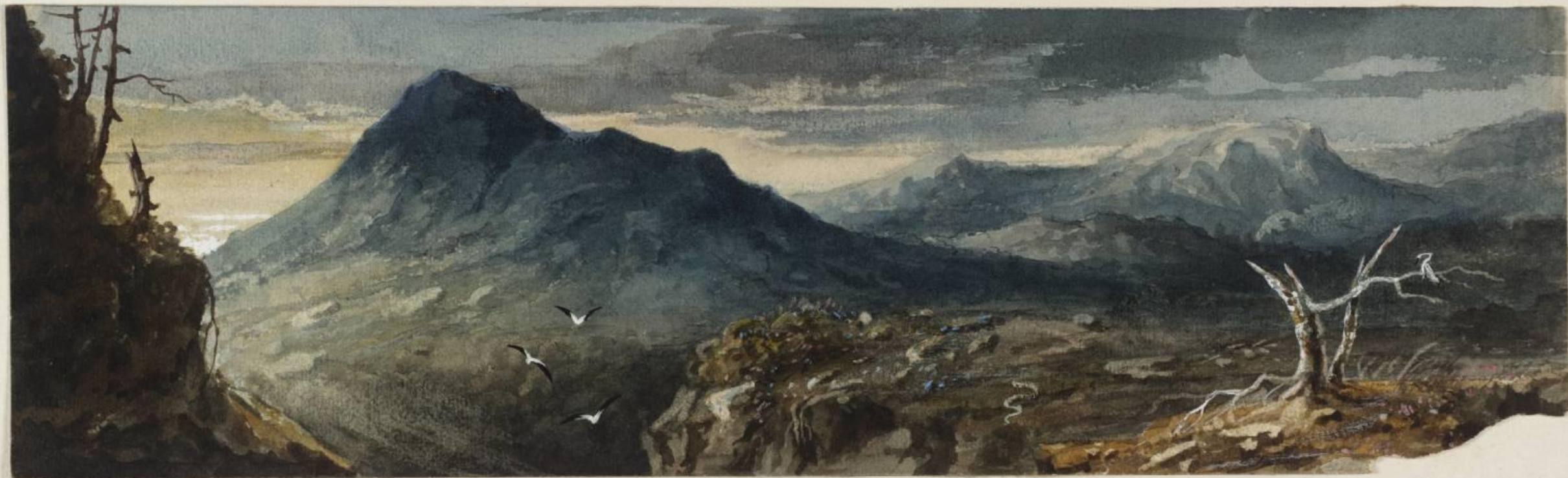
Elizabeth Levenson-Gower, Duchess of Sutherland 1765-1839 Mountain Landscape, Graphite, watercolour and gouache on paper 9 x 31 cm Tate Britain.