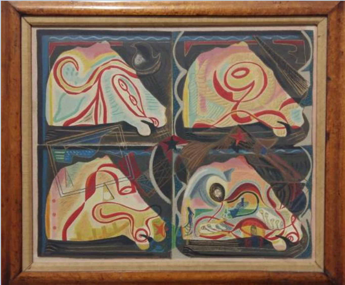
Eileen Agar 1899-1991 Quadriga, 1935, The Penrose Collection.