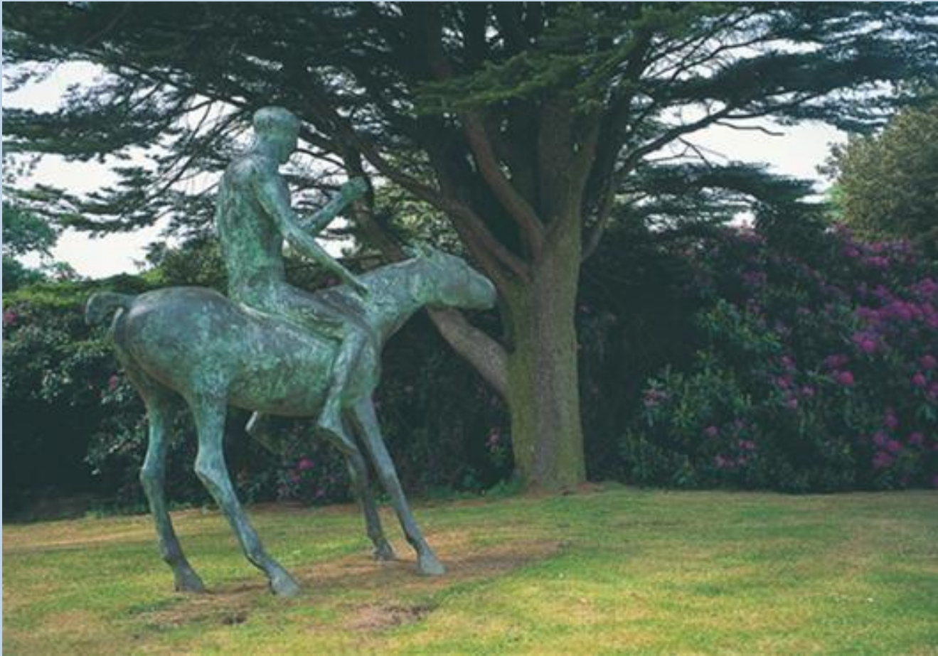
Dame Elizabeth Frink 1930- 1993 Horse and Rider 1969, Bronze