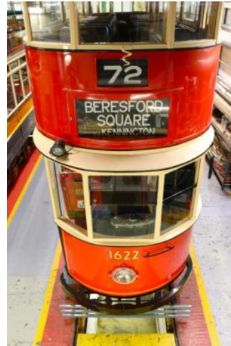
Curved tram front at Crich Tramway Museum - Adrian Hetherington