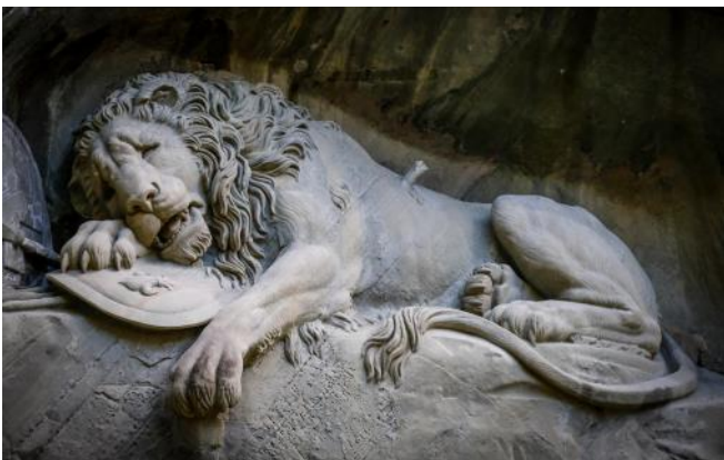
Switzerland - The Lion of Lucerne