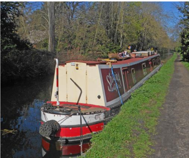
The Chesterfield Canal - Sally Telfer