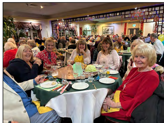
Dukeries u3a contingent