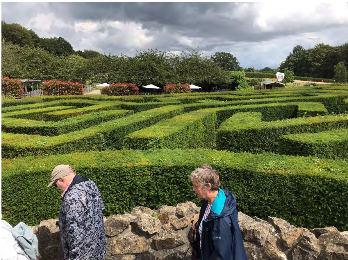
THE MAZE AT LEEDS CASTLE