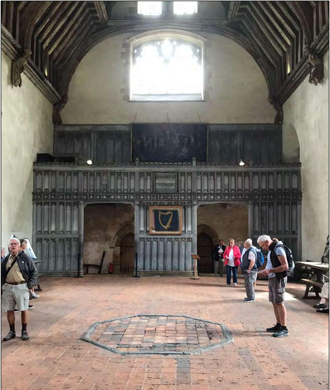
BARONS HALL, PENS HurST

Built in the style of a defended manor house, this is one of England's oldest family homes. Completed in 1341, much of it remains in its original state with two wings joined by a magnificent central hall that would have been hard to surpass for size and splendour. The walled gardens, 600 years old and amongst the oldest in private ownership, are divided into secret and intimate gardens through arches and tunnels cascading with sweet blossom of roses and clematis. Penshurst was used in the BBC filming of Wolf Hall.