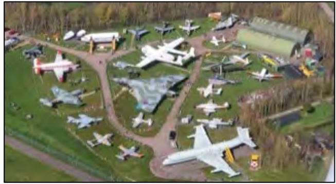
The Aeropark from the air