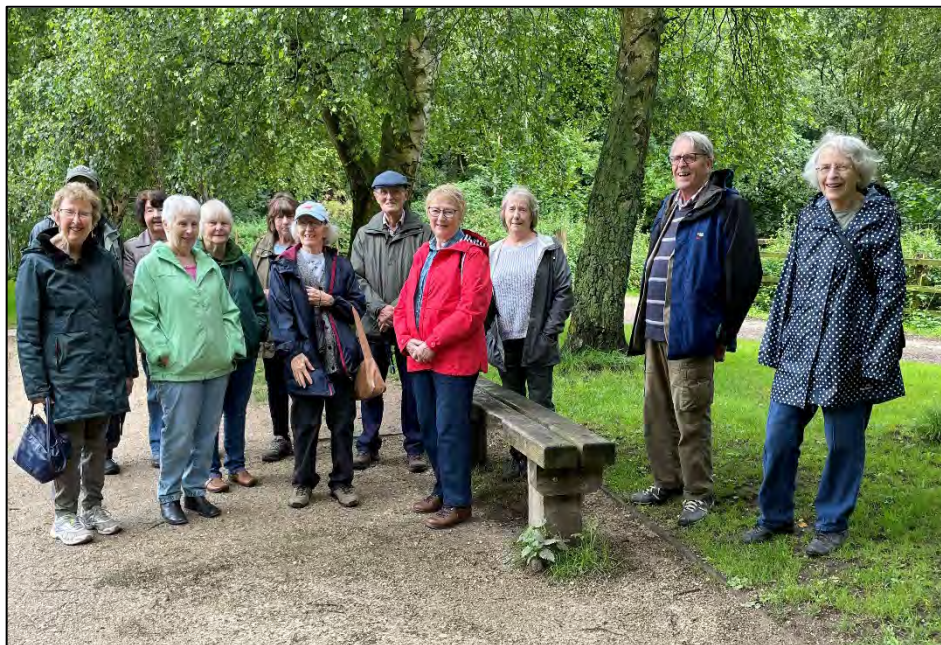
Our "foodies" and "Strollers" have been out and about.