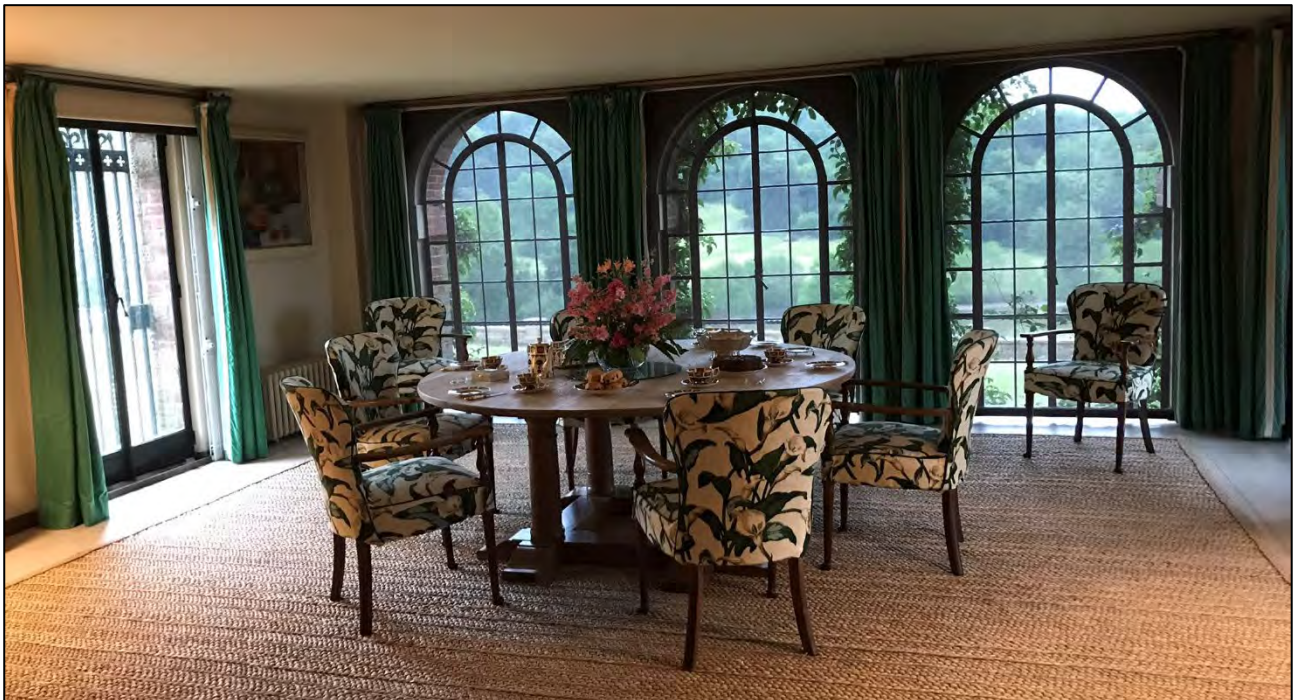
FAMILY DINING ROOM CHARTWELL

The estate which originated in 1382 was purchased by Churchill around 1922 for £5,000. The house has a very homely feel and the visitor can easily imagine the young Churchills running through corridors, up and down its staircases playing hide and seek. A separate building used as a studio houses many of Churchill's art work.