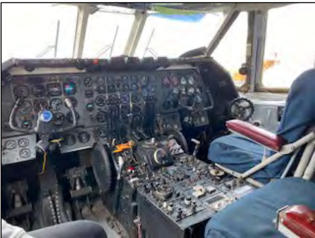
VC10 flight deck