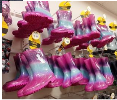
Ready for the Rain by Pippa Ramsey