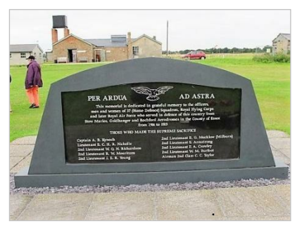
The Memorial erected in December 2010 to commemorate those killed in the line of duty