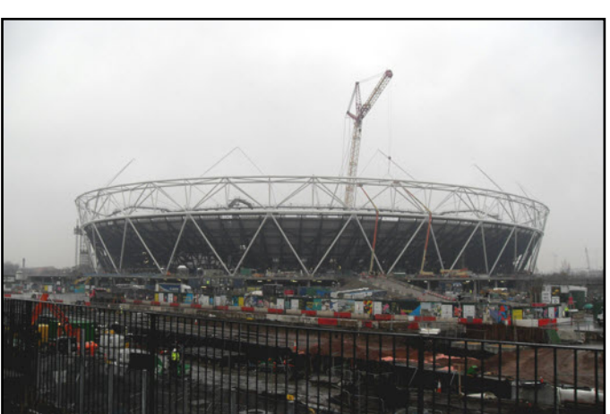
Olympic London Trip - March 2010