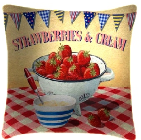
Here comes Summer