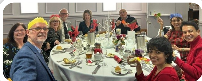
table games and a draw for each of the lovely Christmas table plants.

As always, a Membership table will be ready at the February and March Members Meetings for us to take cheques if this is your preferred option. We do not take cash unfortunately.