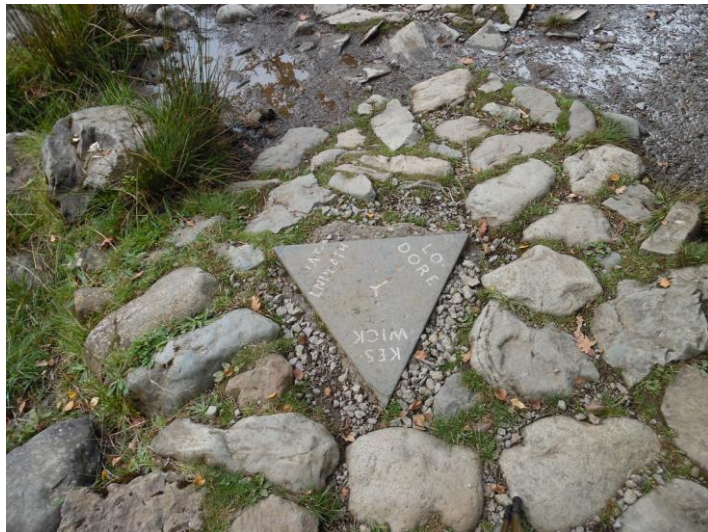
Watendlath - Lodore Falls - Keswick - ' Waymarker '