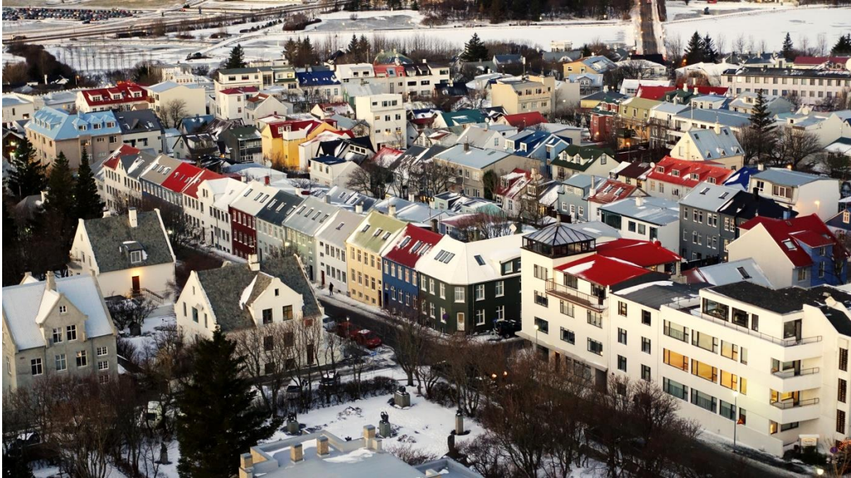
Reykjavik from the top of the church

Nine of us booked an Icelandair 3 night visit to Reykjavik which included a tour to try and see the Northern Lights. Our hotel, the Leifur Eiriksson, was well situated near the centre of town and right opposite Hallgrímskirkja, a 73 metre high Lutheran parish church. There were excellent views of the town from the top.