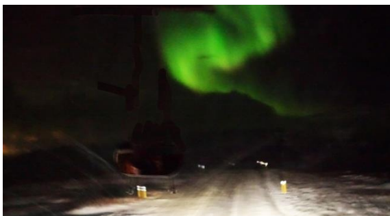
through the coach windscreen

We could even see them through the coach windscreen as we were driven back to the hotel (photo below left). We then encountered a blizzard so extreme that visibility for the driver became zero (photo below right).