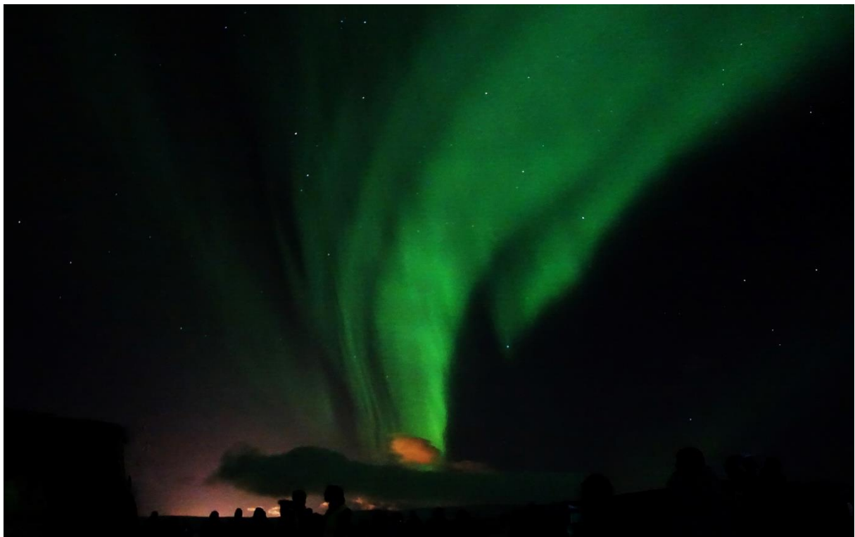
The Northern Lights

We could even see them through the coach windscreen as we were driven back to the hotel (photo below left). We then encountered a blizzard so extreme that visibility for the driver became zero (photo below right).