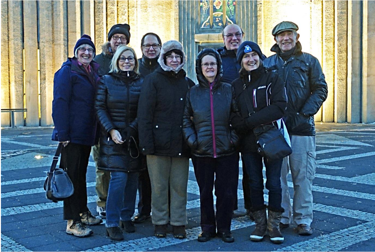
Our happy group on the morning of our return home