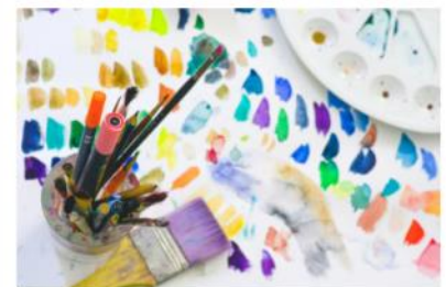
Colours in the Fog