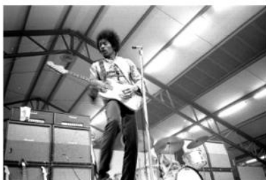
See Emily Play