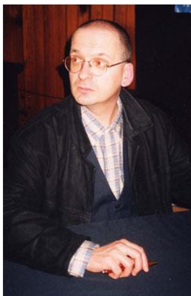
Roddy Doyle (born 1958)