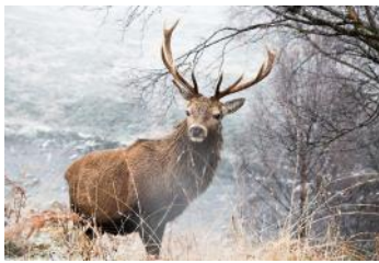
Red Stag Deer