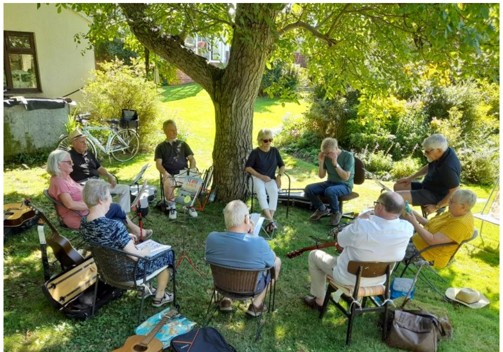
Under the walnut tree