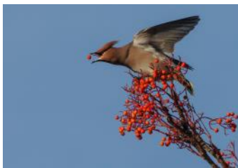
Waxwing With Rowanberry

A couple of photos from the u3a's "Found in Nature" Initiative: