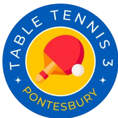
Table Tennis 3 are now 20 members for the Friday's Table Tennis group in Pontesbury but are always looking to welcome new members. Please feel free to come along to the Congregational Church

Hall Friday mornings from 10am – noon. We are of diverse abilities, so everyone is welcome.