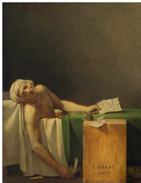
The Death of Marat: Jacques-Louis David