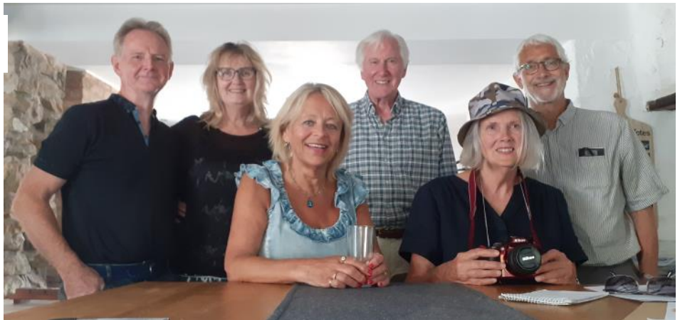
Photography Group founder members