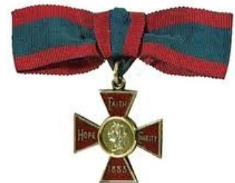
Royal Red Cross