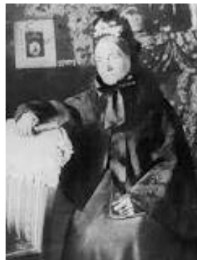
An Irish Great Grandmother