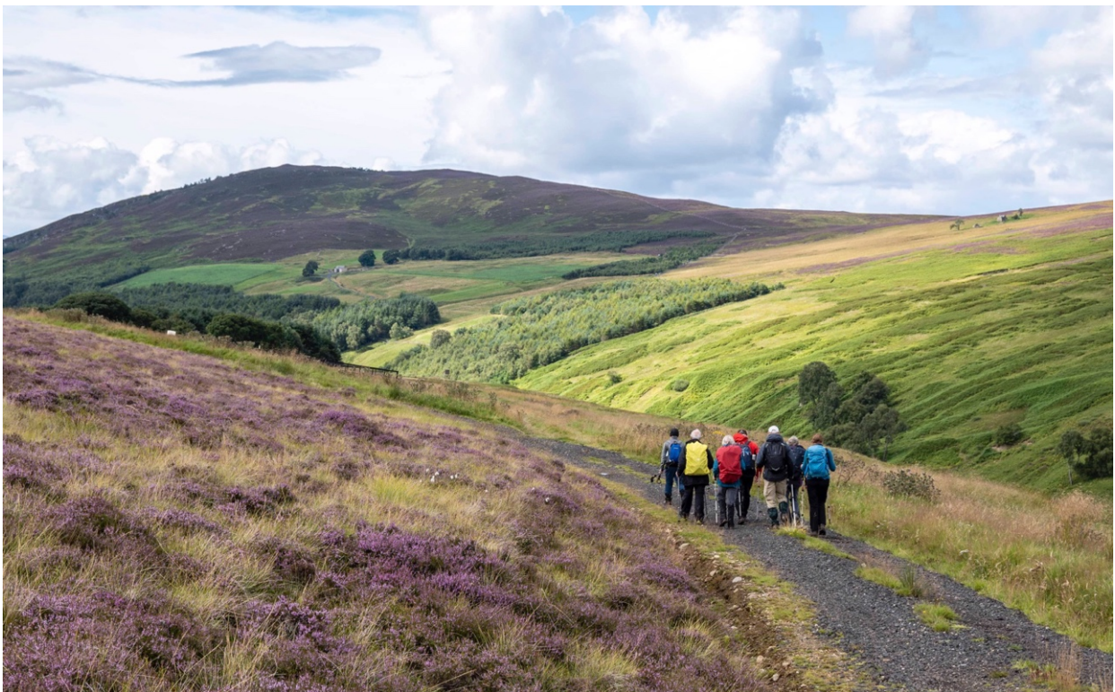
Walking down Glen Girnaig