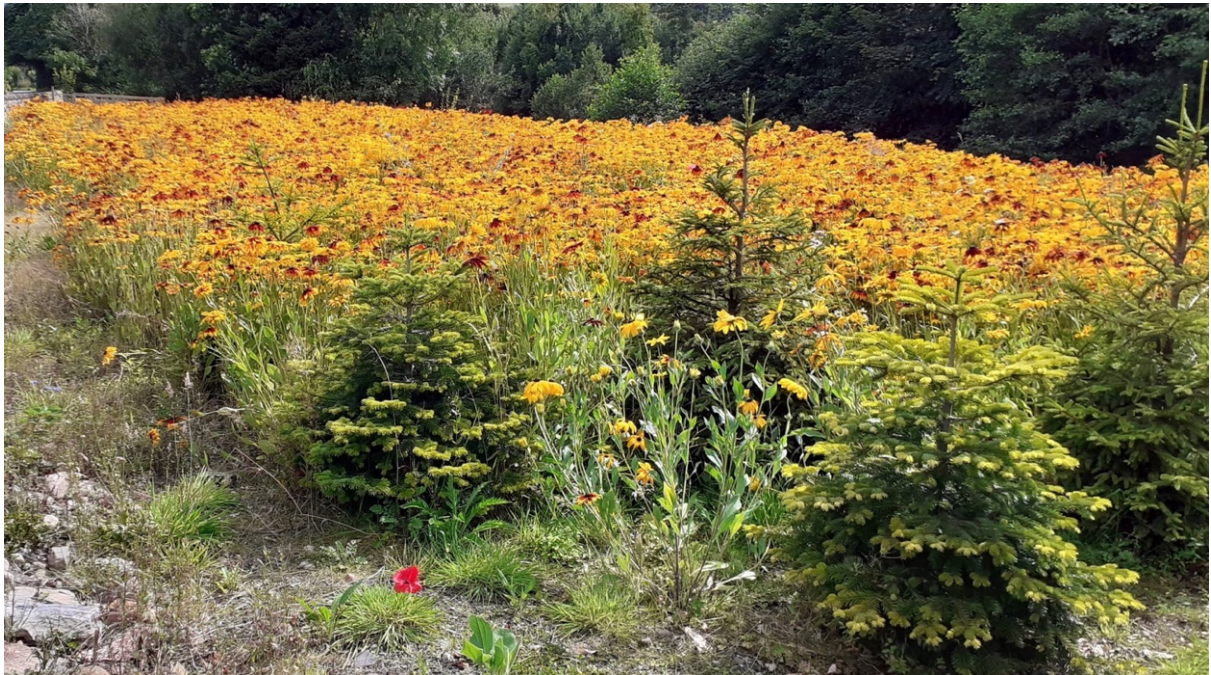
A splash of colour beside the railway