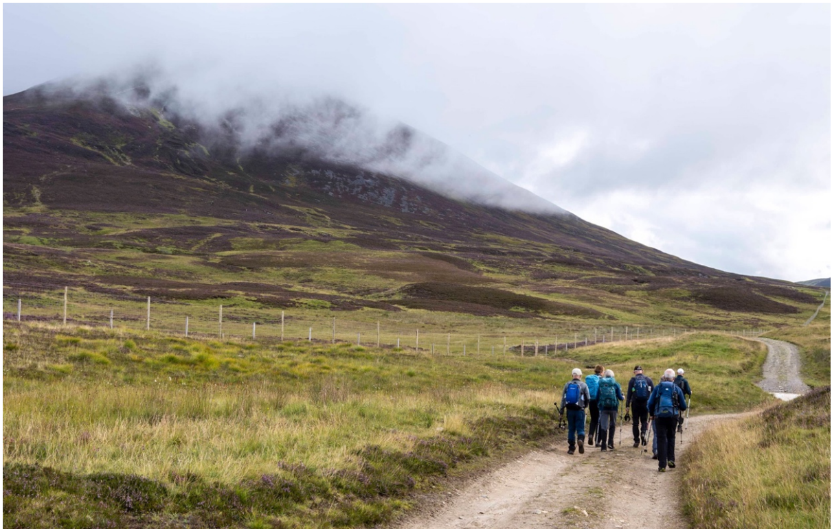
Walking the track at the start of the walk