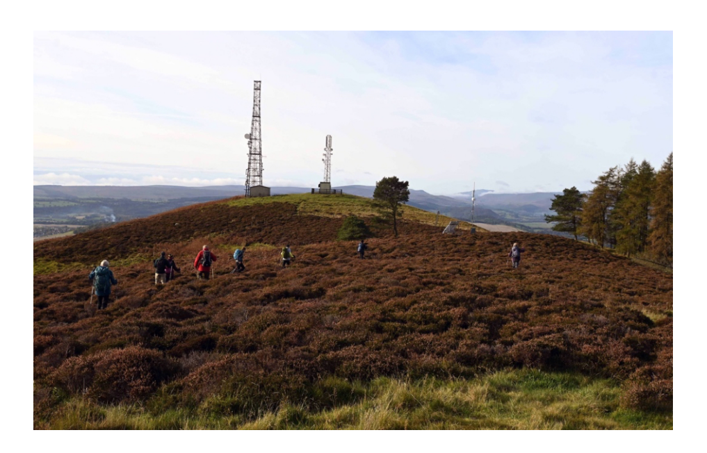
Ascending Milquhanzie Hill