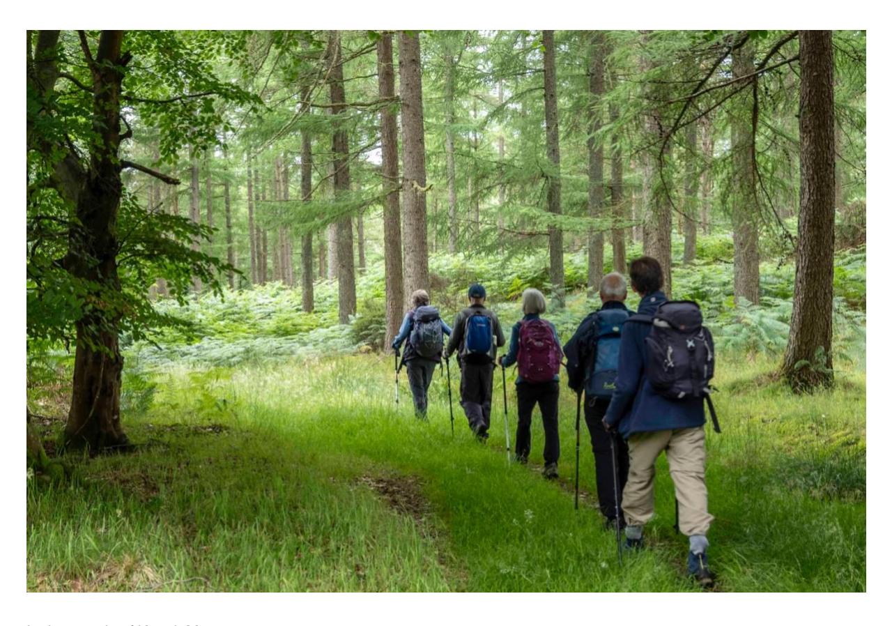
In the woods of Knock Mary