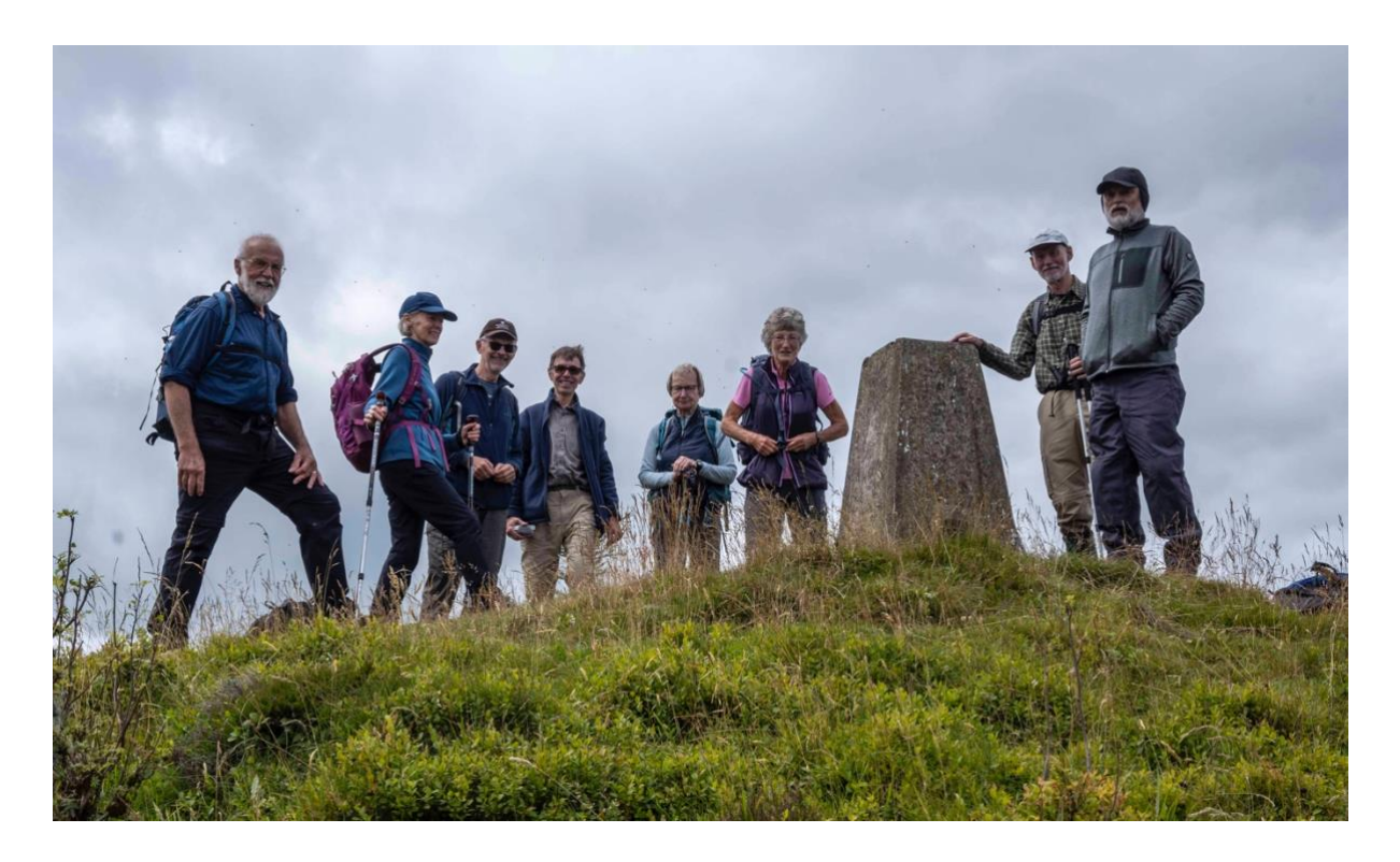
Summit of Torlum after lunch