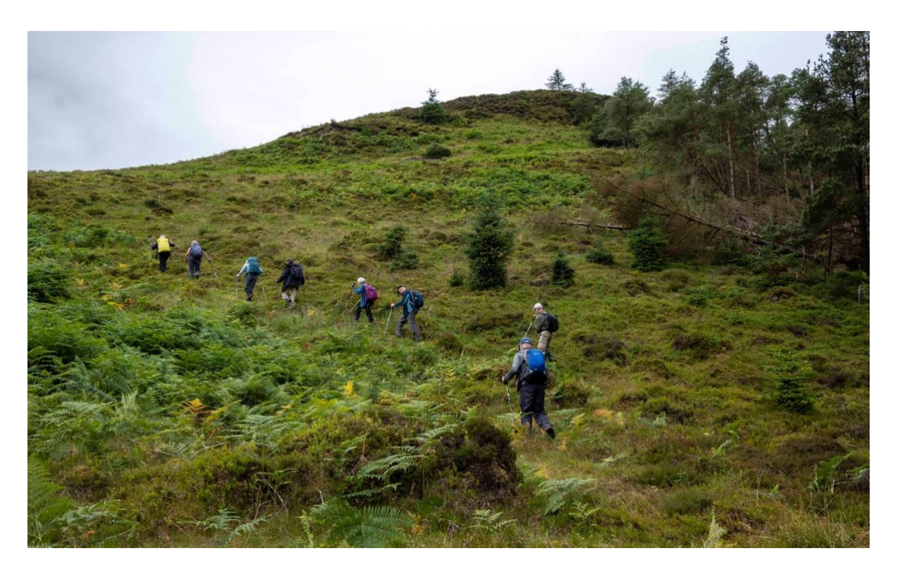
The final section of the climb to the summit of Torlum