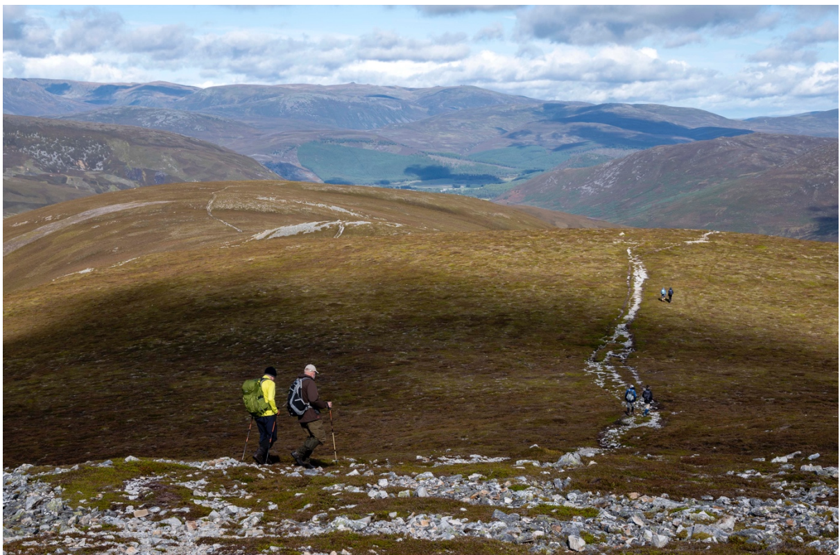
Following the route back down