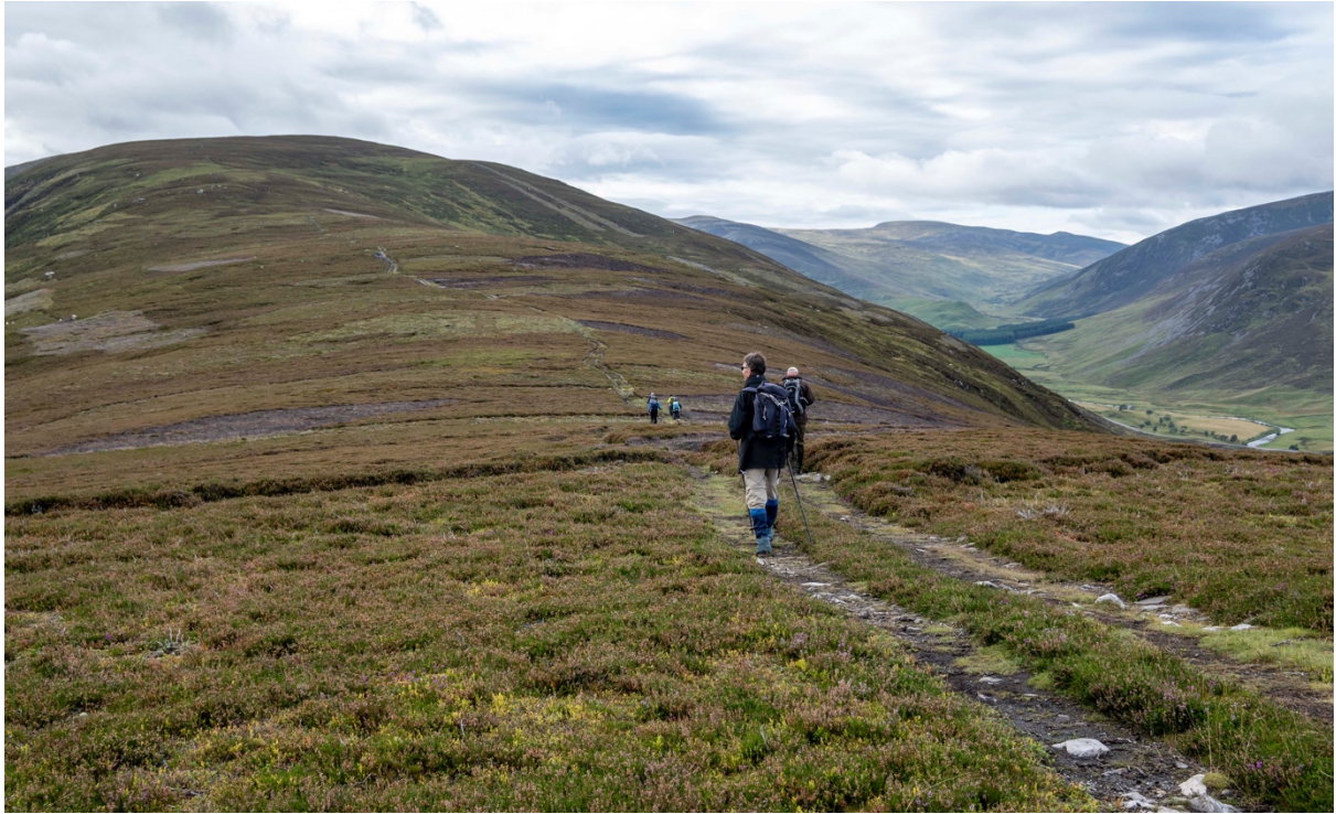
At the start of the climb