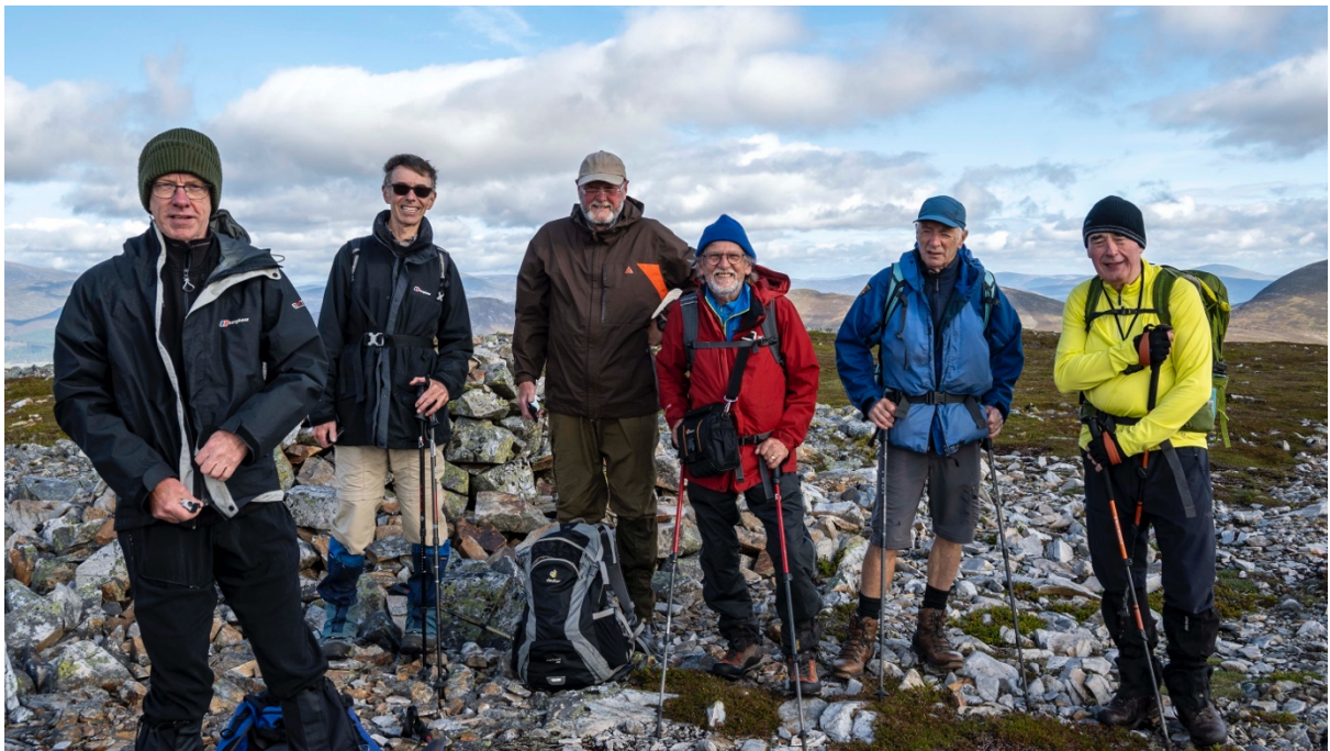
At the summit – looking very pleased with ourselves.