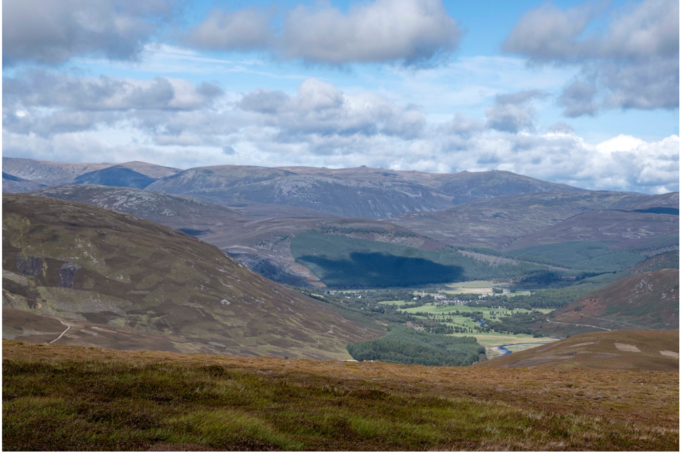
Breamar in the sun with the Cairngorms in the background.