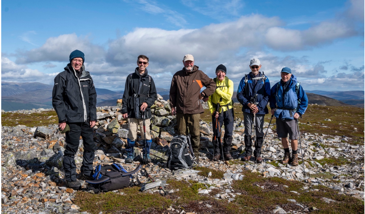
Another summit picture with a second camera man and we are still smiling.