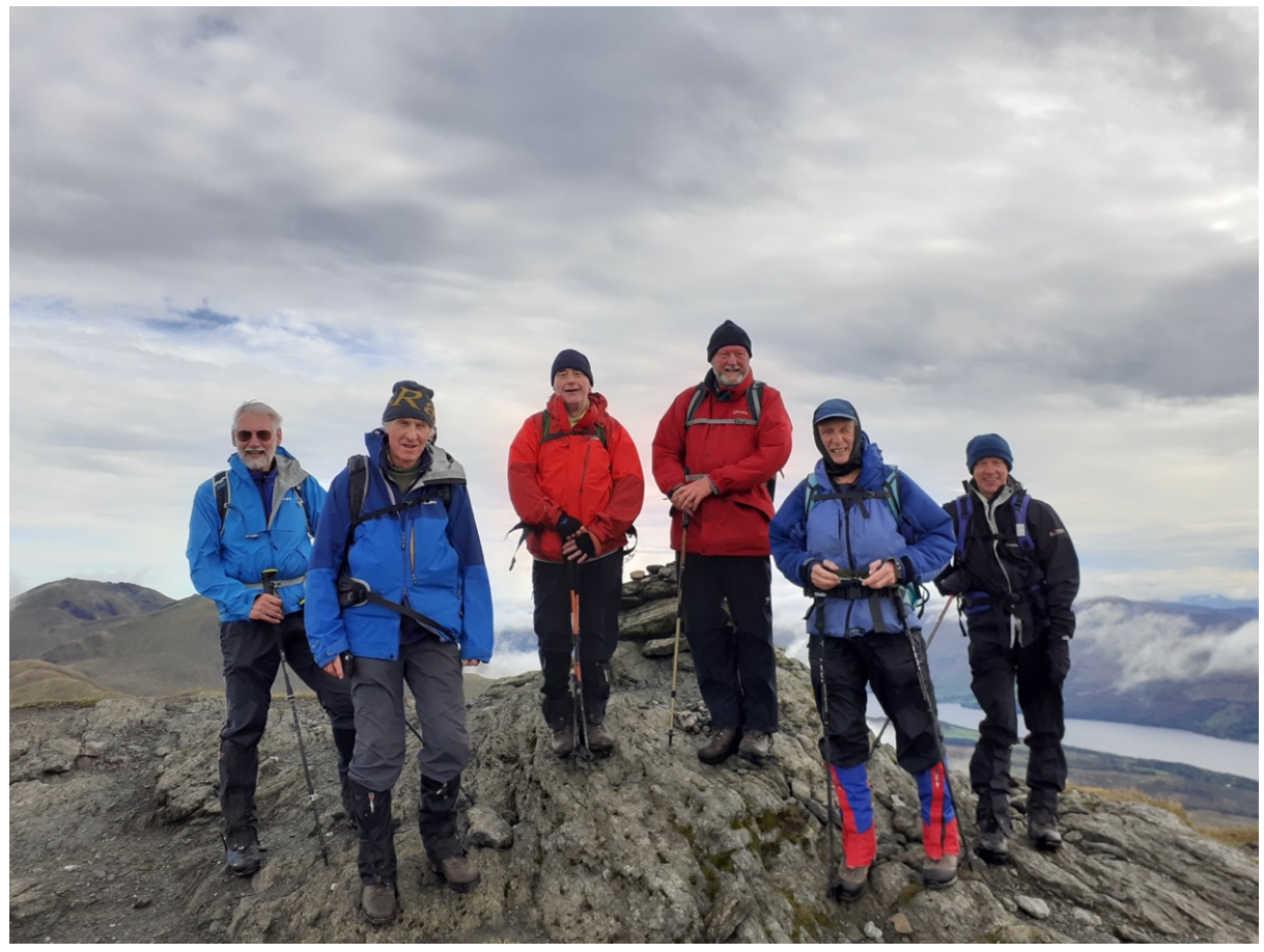
One more for the records.