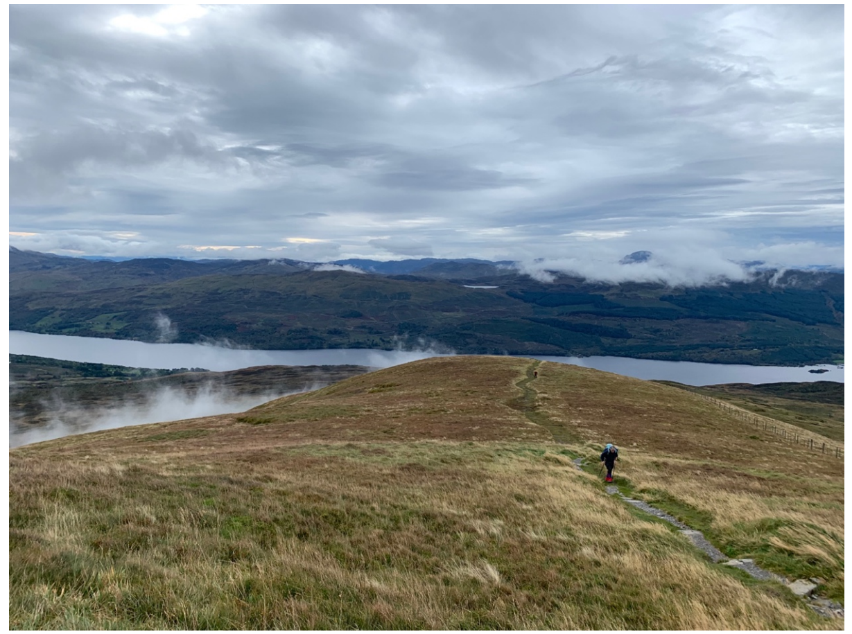
On route to the first Munro – Meall nan Tarmachan. Loch Tay in the background