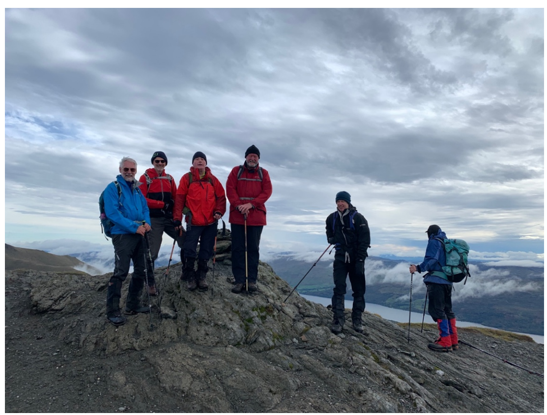
At the summit of Meall nan Tarmachan