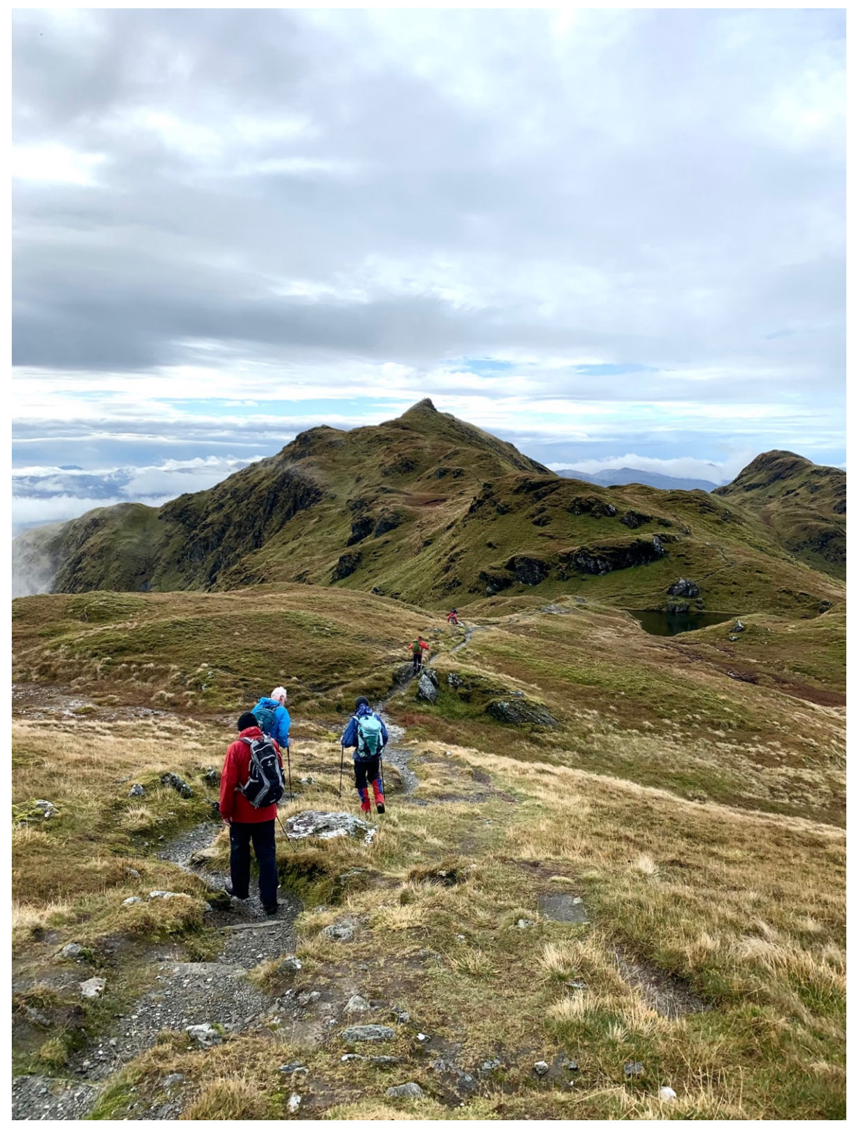
Dropping down on route to Beinn nan Eachan