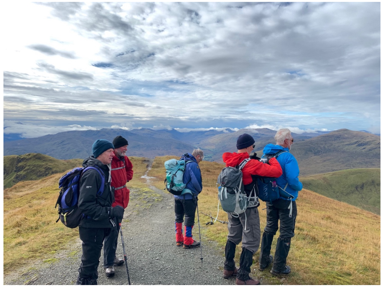
Getting ready for the final descent.