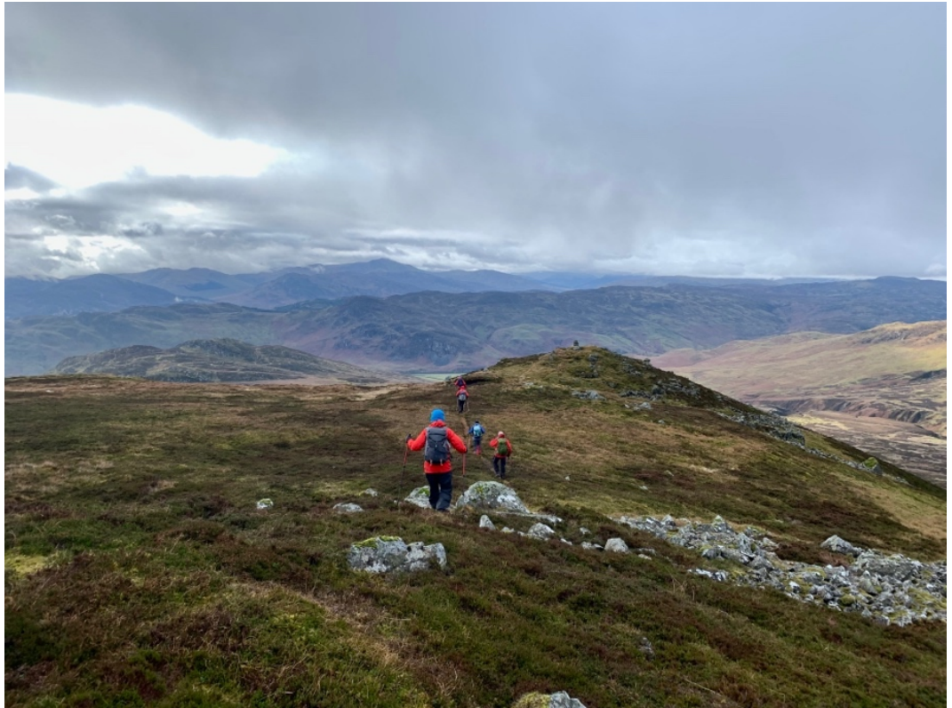
Leaving the main path to head for Creag Gharbh