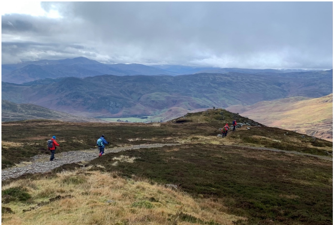
Back in to the full sunshine