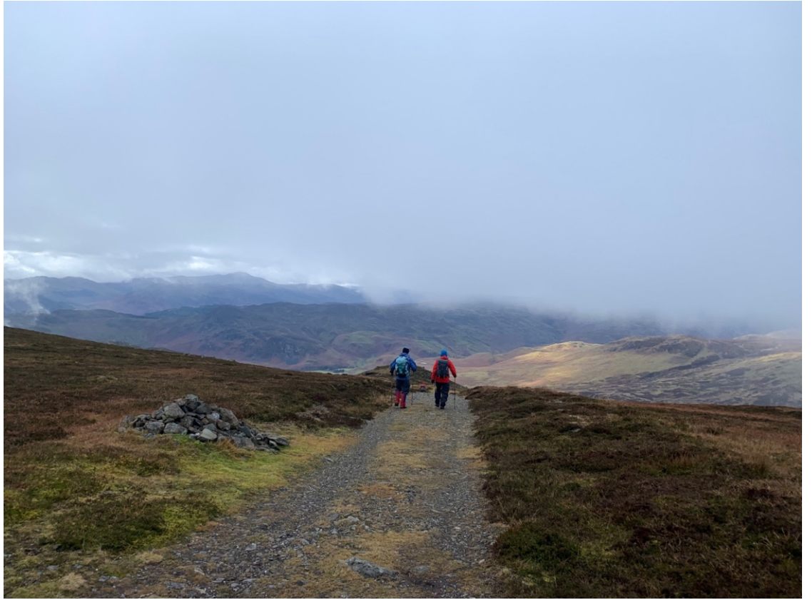
At the start of the descent after reaching the main path