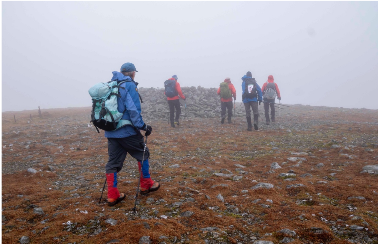
We reach the summit marked by an old stone shelter.