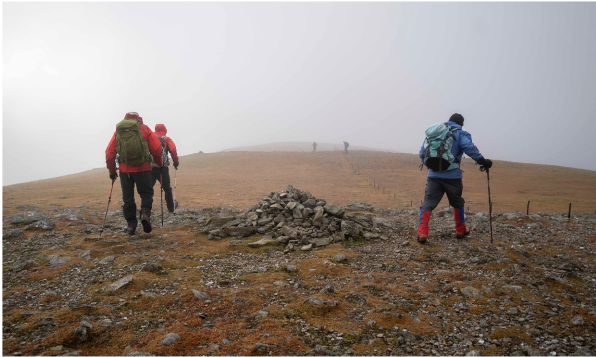
At the start of the descent, the mist starts to clear