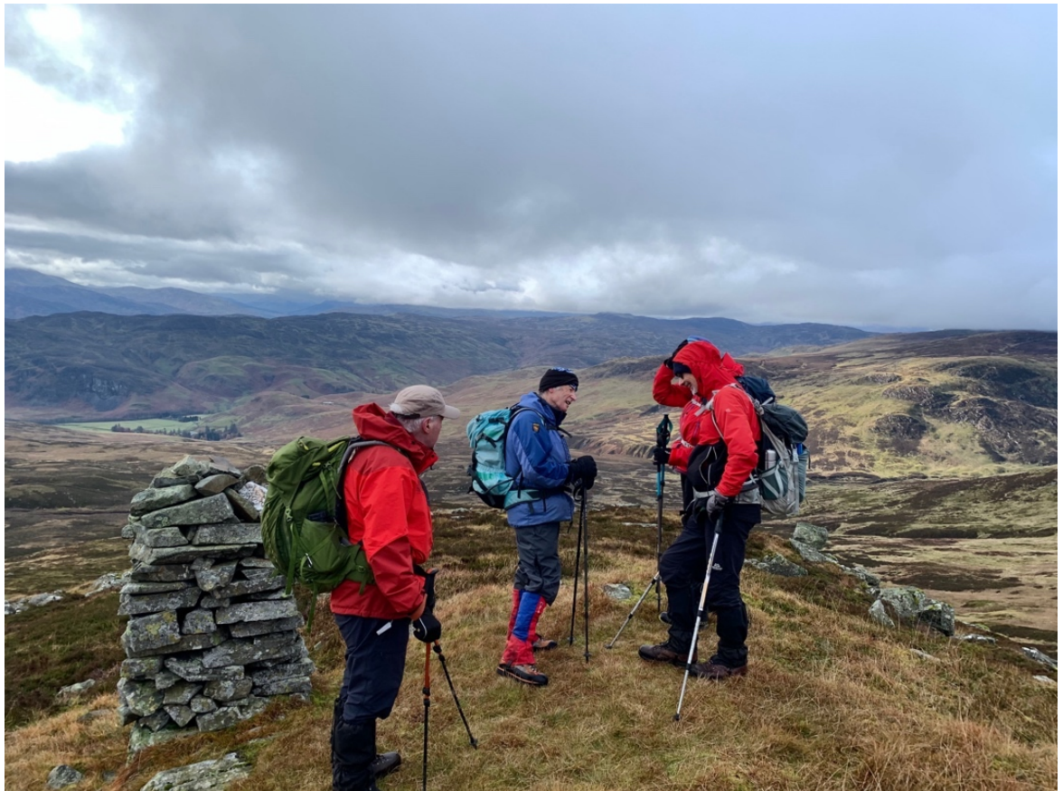
At the cairn of Creag Gharbh