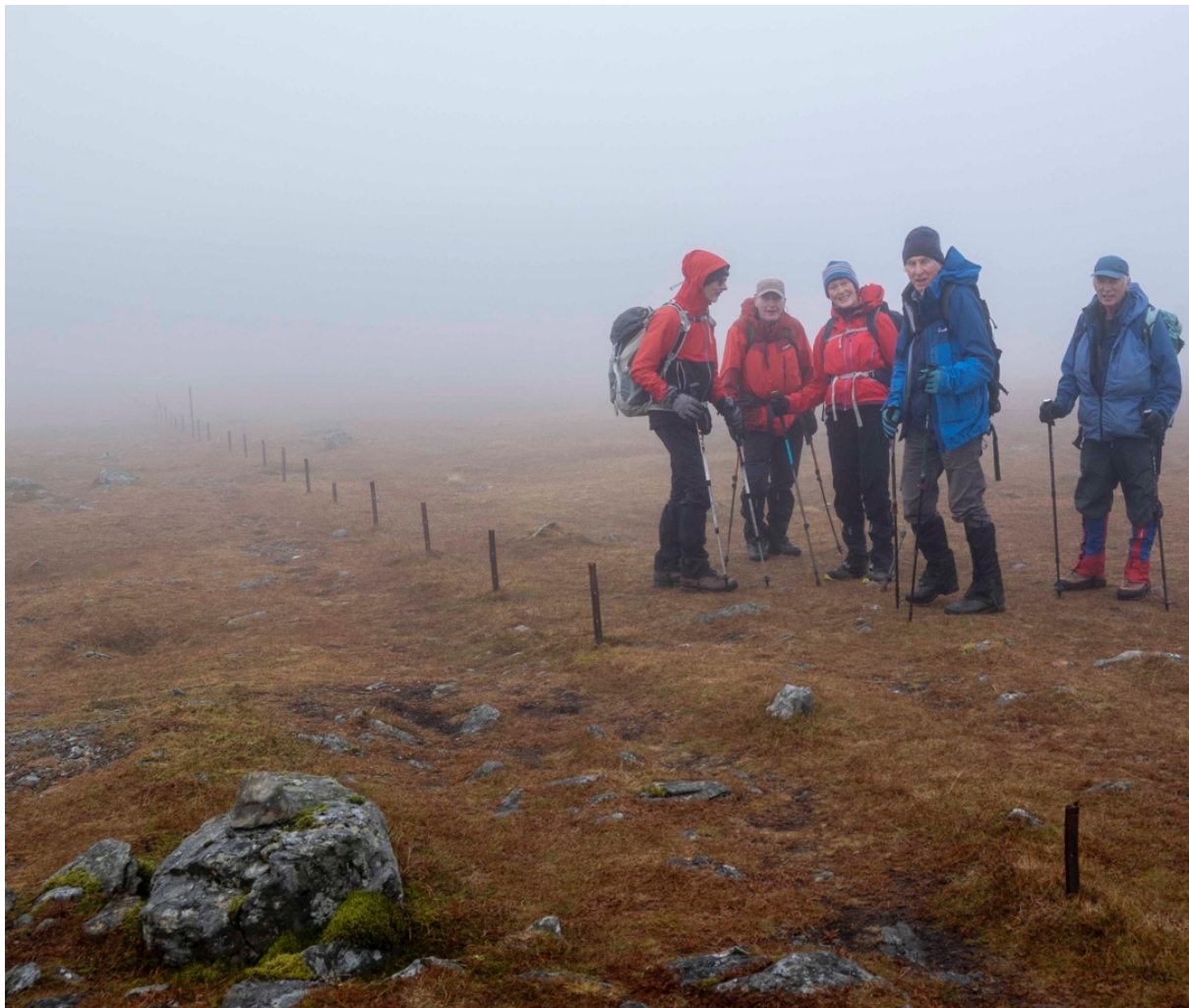
On the upper slopes, the old fence line is a welcome guide in the mist.