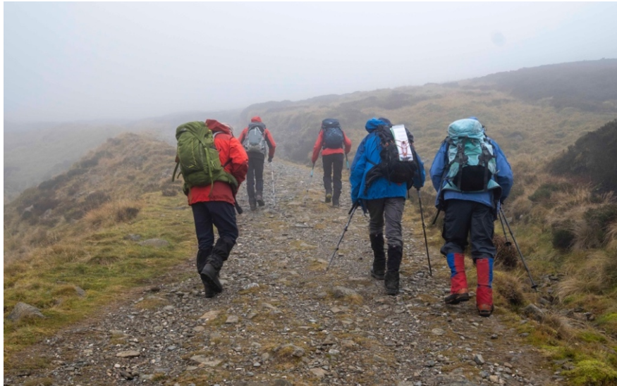
We commence the ascent up the main track and into the mist