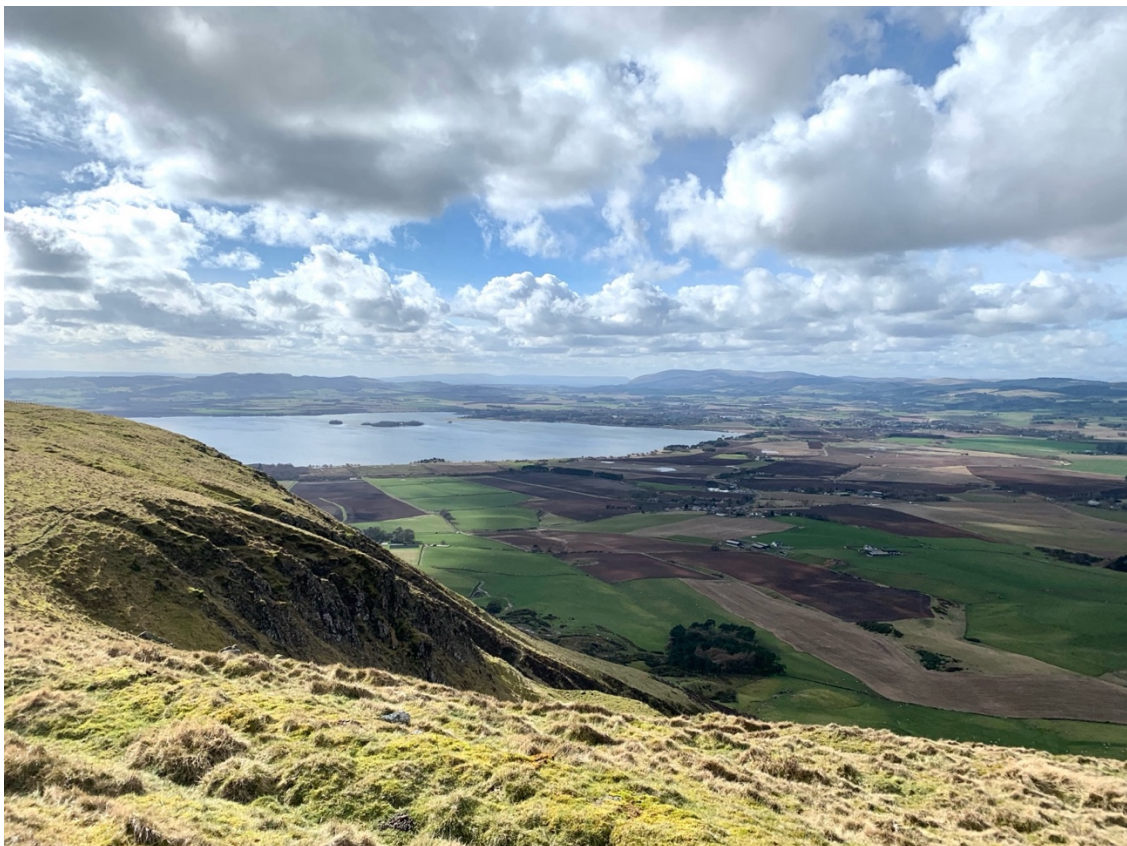
Views towards Loch Leven close to Bishops Hill summit.