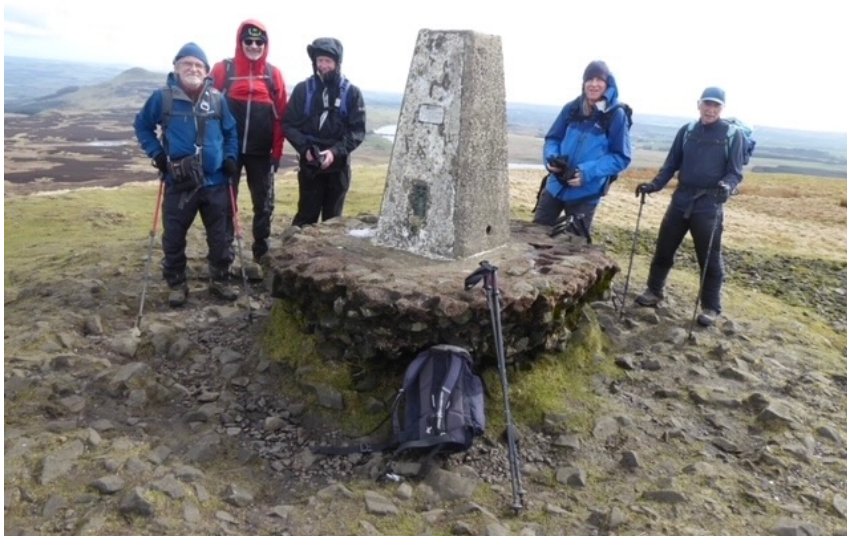
At W. Lomond trig point ( showing extensive signs of soil erosion)