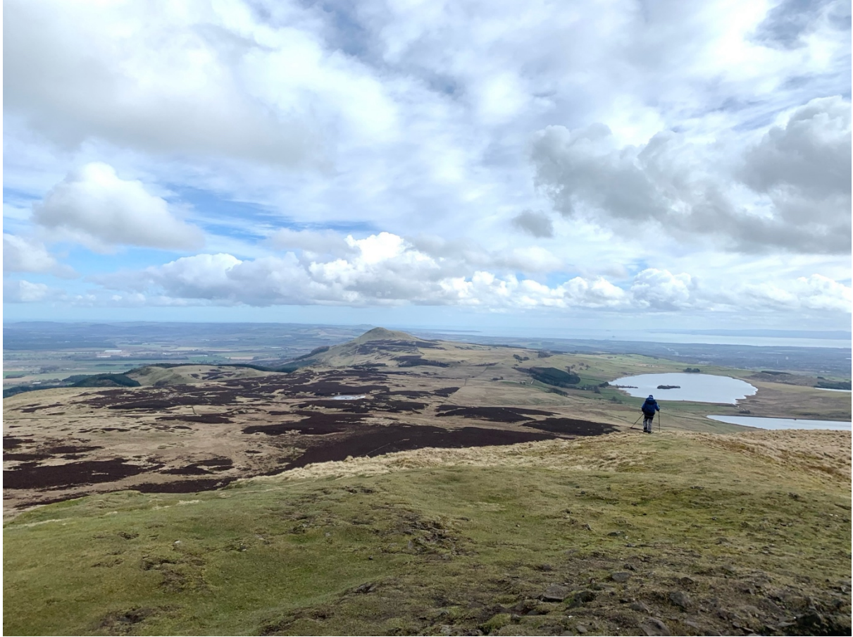
After coffee the approach to West Lomond