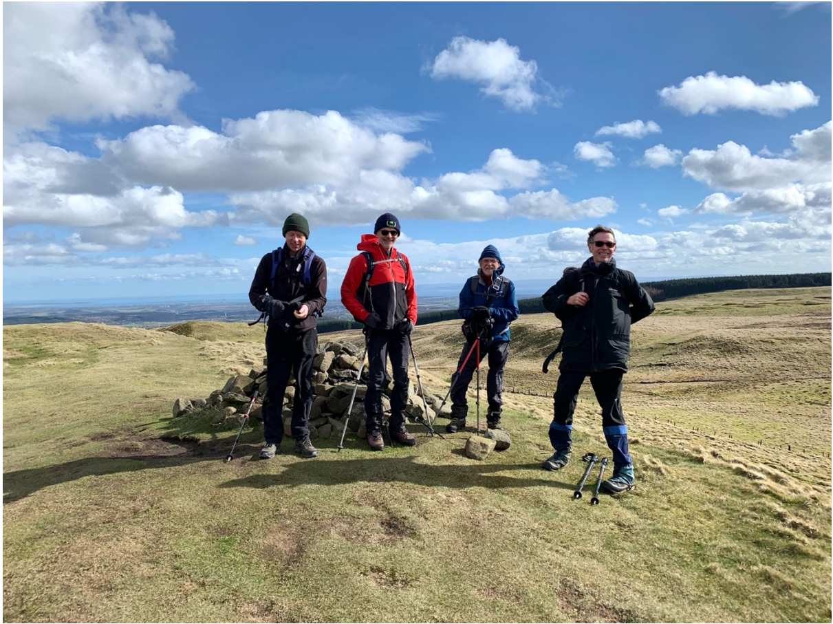
At the summit of Bishops Hill