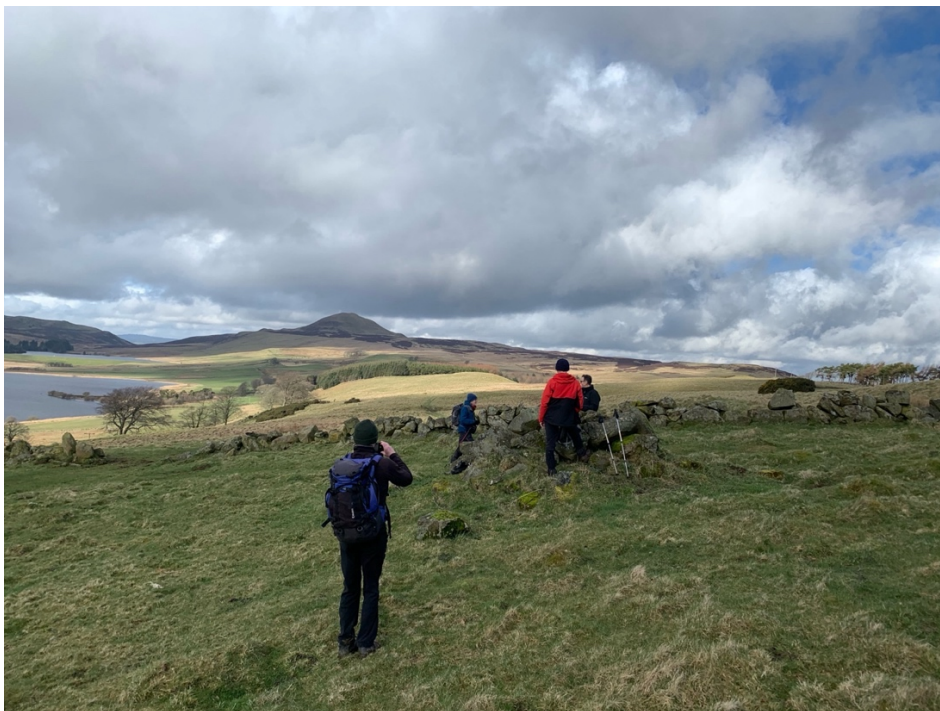
Admiring the Lomonds