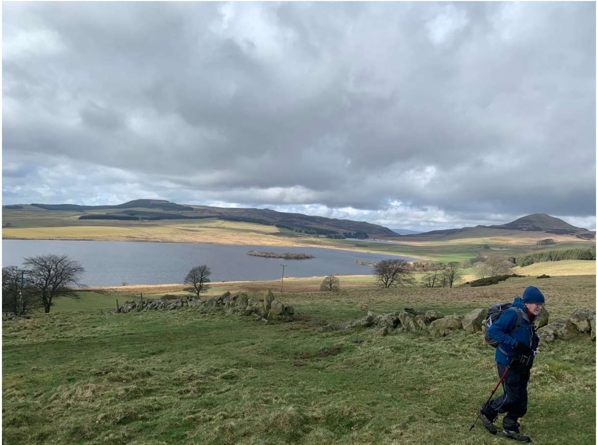
Continuing up the slope