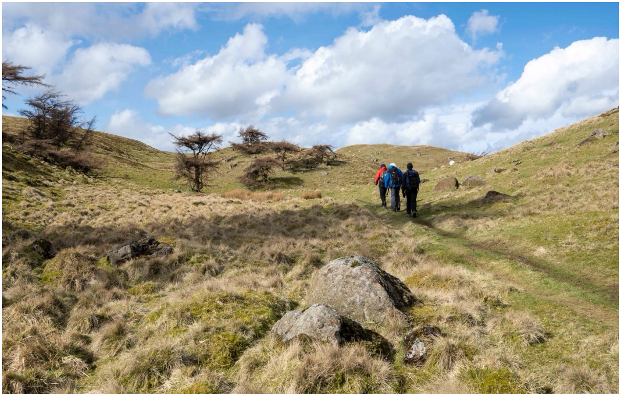
On route to Bishops Hill following our lunch stop