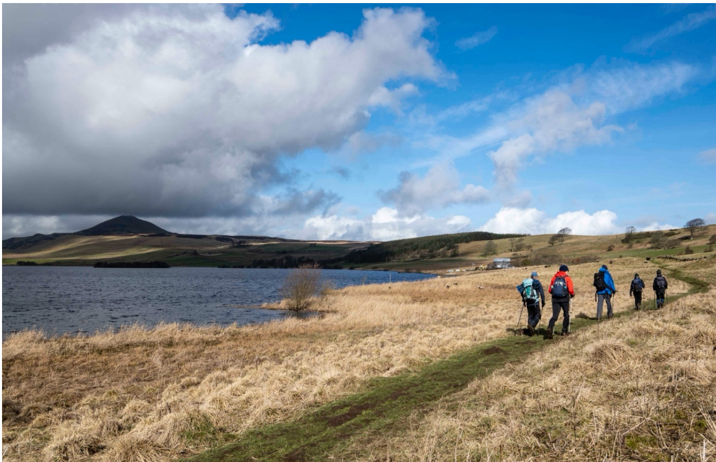
Leaving the loch we set off along a well-marked path.

The day was finished off with coffee and cake at Loch Leven's Larder. A great day was had by all.