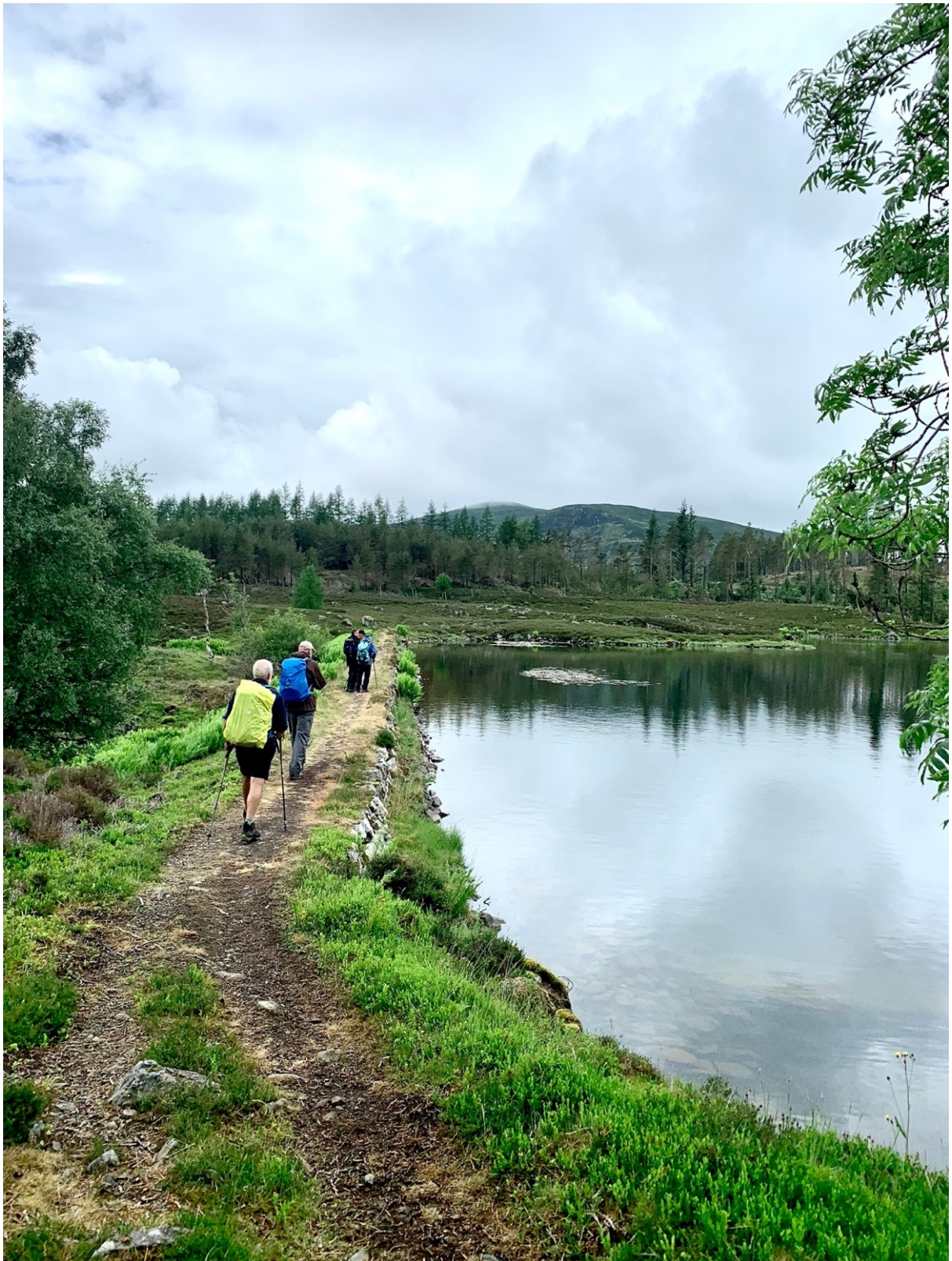
Passing the second Loch – Loch Auchintaple