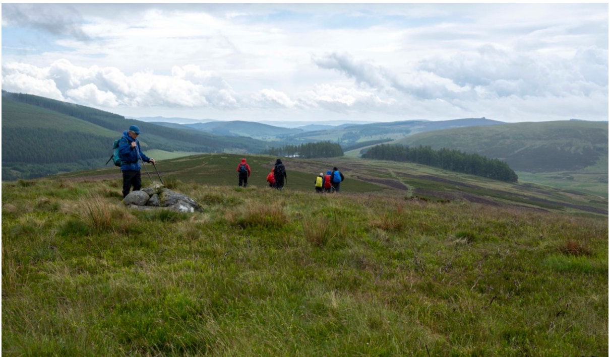
At the highest point