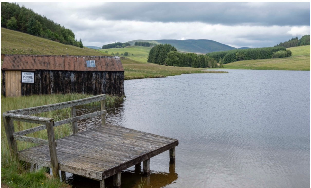
A last look at loch Shandra before reaching the car park.