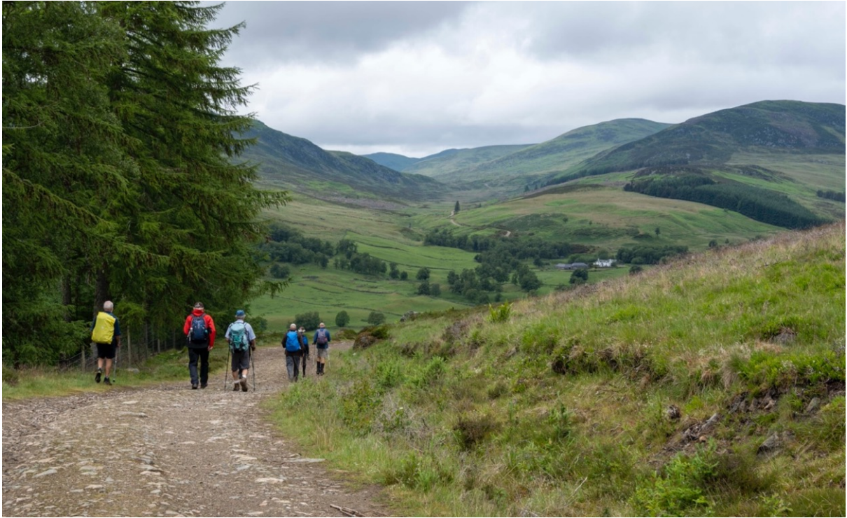
On the Cateran Trail