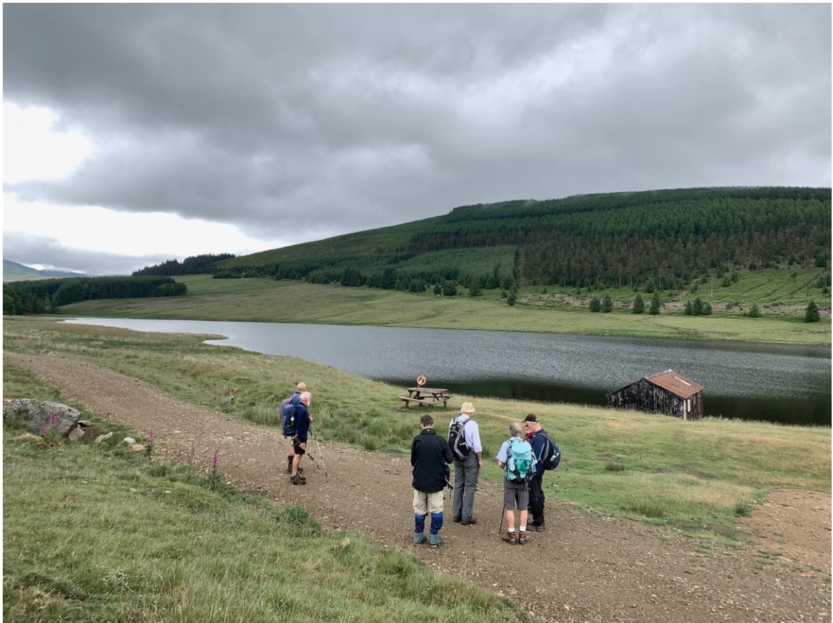
On the main path next to Loch Shandra