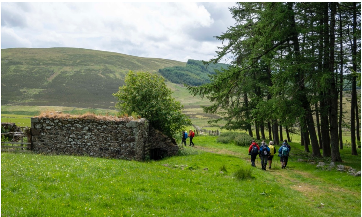
Reaching the ruins at Craighead