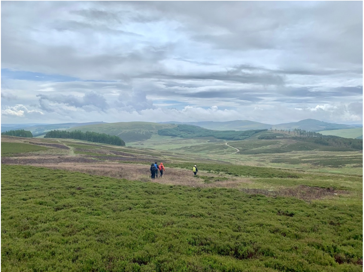
Dropping down back towards Loch Shandra