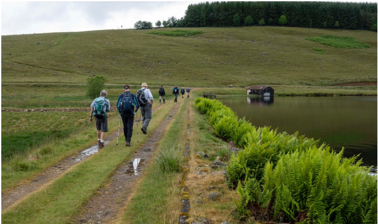
On route to the first Loch – Loch Shandra